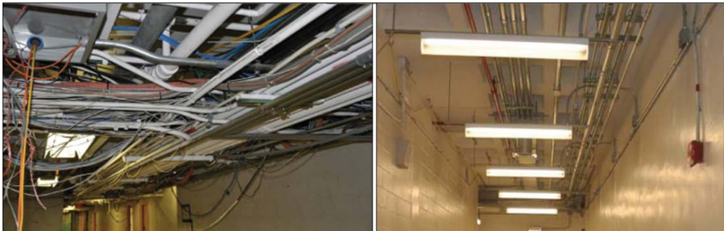
Figure 3: Ceiling Conditions in the Basement of a UN Building before and after Renovation