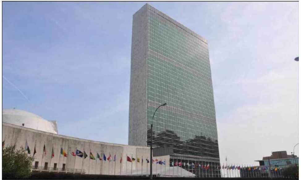
Figure 2: Glass Curtain Wall of the Secretariat Building, as of May 2012