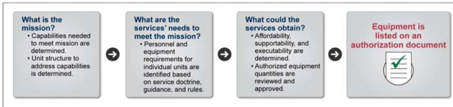
Figure 2: Development of Authorization Documents in the Army and the Marine Corps