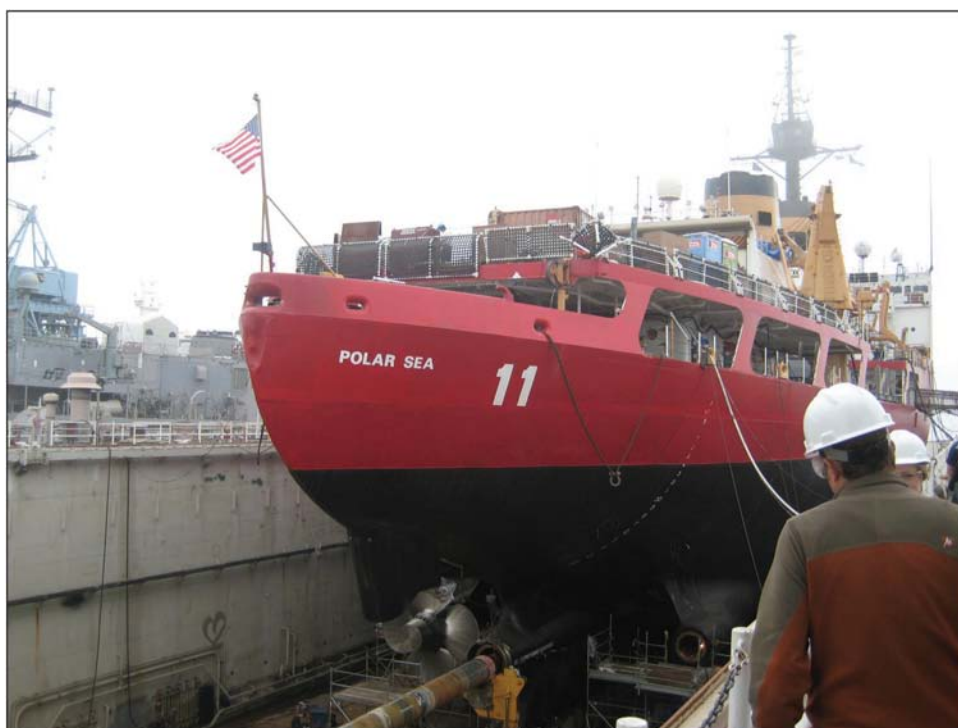
Figure 2: Polar Sea in Dry Dock