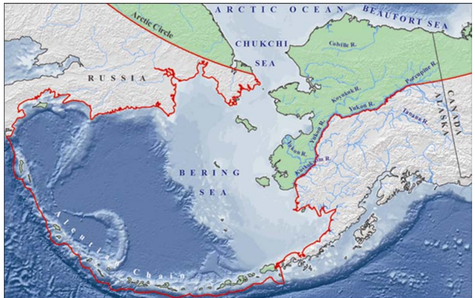
Figure 3: Map of the Arctic Boundary as Defined by the Arctic Research and Policy Act