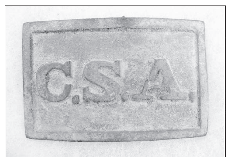
Figure 4: Civil War Artifacts Stolen from Fredericksburg and Spotsylvania National Military Park