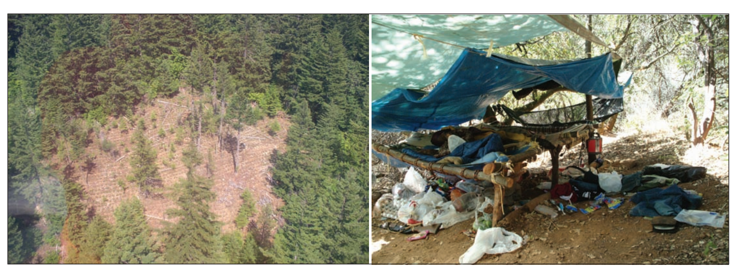
Figure 5: Damage Caused by Marijuana Cultivation

Cleaning up cultivation sites is important, not only to restore damaged areas, but also to make it less likely that growers will return, agency officials told us. In 2008, the National Park Service restored 14 marijuana cultivation sites in its Pacific West Region. To clean up these sites, the National Park Service removed more than 10 miles of irrigation hose, about 10,000 pounds of trash, and more than 3,700 pounds of fertilizer, as well as pounds of hazardous chemicals such as pesticides (see fig. 5). Cleaning up marijuana cultivation sites costs an estimated $10,000 to $15,000 an acre and reduces the agencies' ability to accomplish other planned work, according to agency officials.