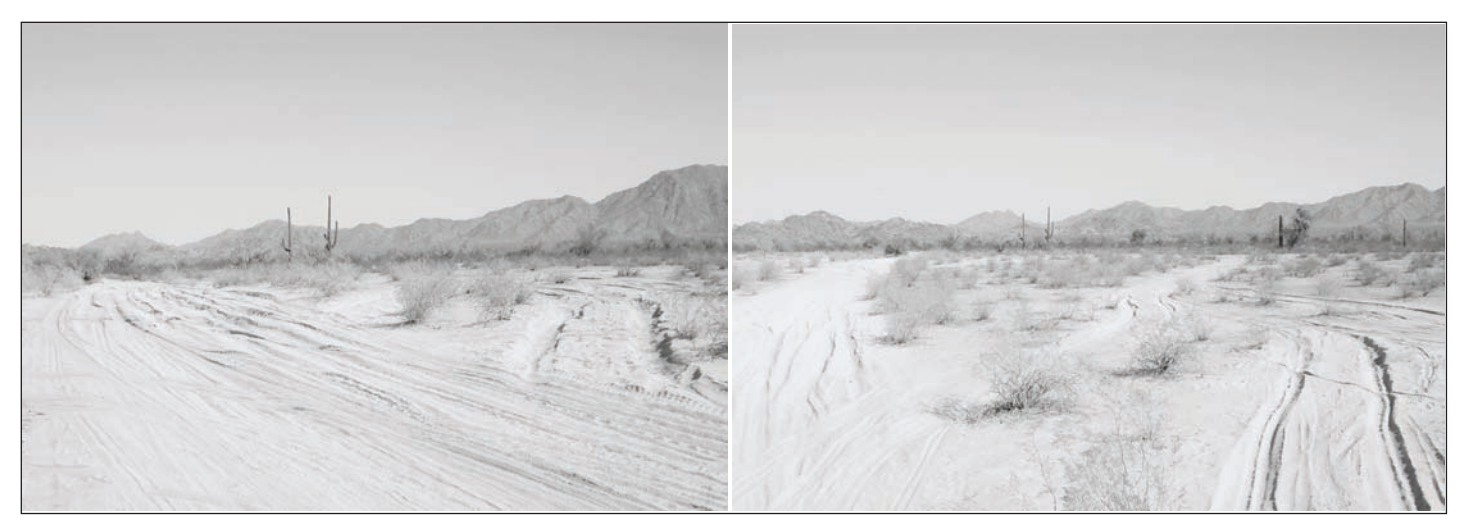
Figure 2: OHV-Related Damage at Sonoran Desert National Monument

historical sites. For example, soil and vegetation damage from unauthorized OHV use at Sonoran Desert National Monument in Arizona was severe enough that in 2007 the Bureau of Land Management closed about 55,000 acres of the monument to all motorized vehicles (see fig. 2).