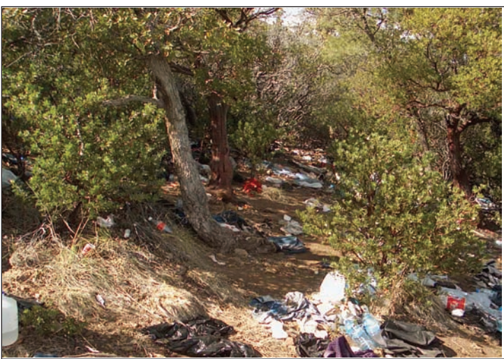
Figure 6: Vegetation and Soil Damage and Garbage Resulting from Illegal Border Activity