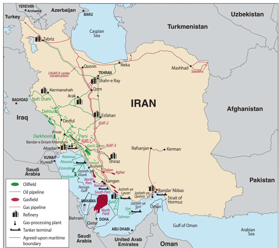
Figure 2: Map of Iranian Oil, Gas, and Petrochemical Activities