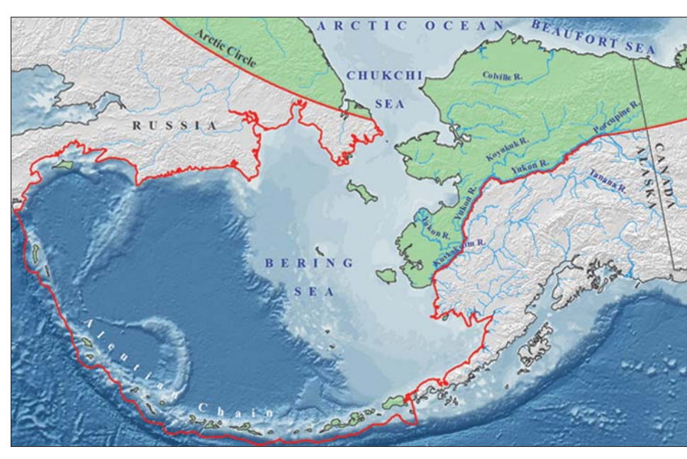
Figure 2: Map of the Arctic Boundary as Defined by the Arctic Research and Policy Act