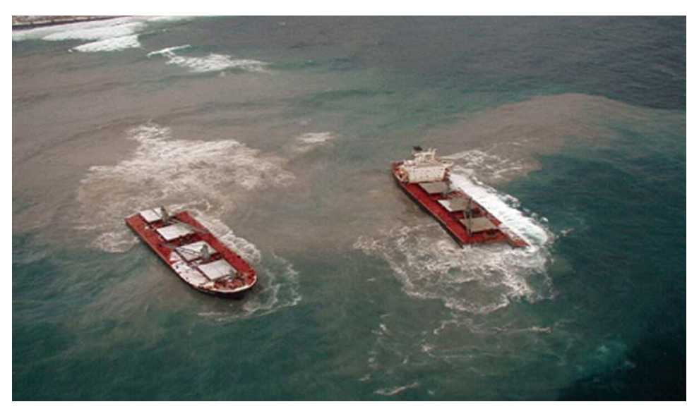
Figure 6: The Grounding of the Vessel Selendang Ayu in the Aleutian Chain