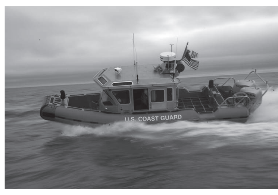
Figure 5: A Response Boat in Arctic Waters Off of Barrow, Alaska