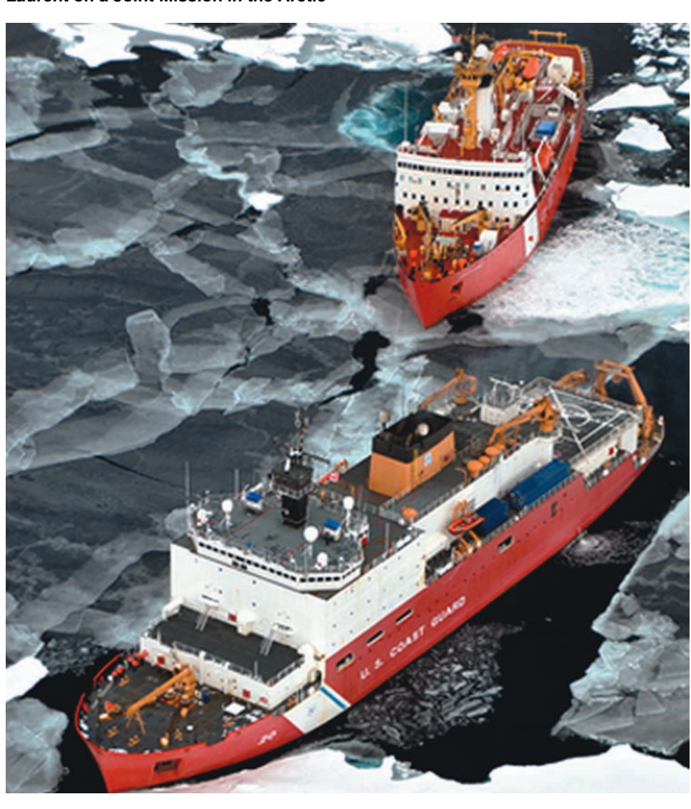
Figure 3: U.S. Coast Guard's Healy and the Canadian Coast Guard's Louis S. St. Laurent on a Joint Mission in the Arctic