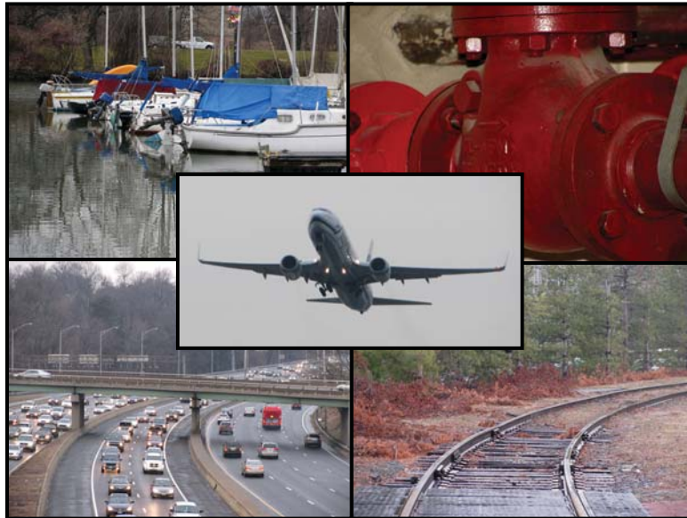
Figure 7. NTSB Investigative Modes: Aviation, Marine, Pipeline, Railroad, and Highway