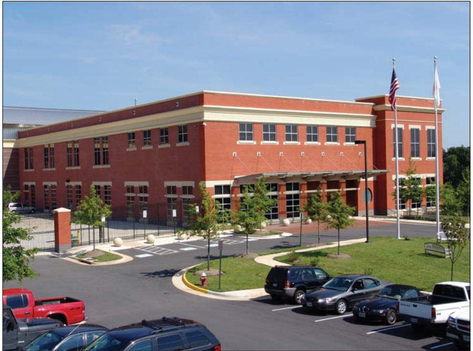
Figure 6: NTSB Training Center