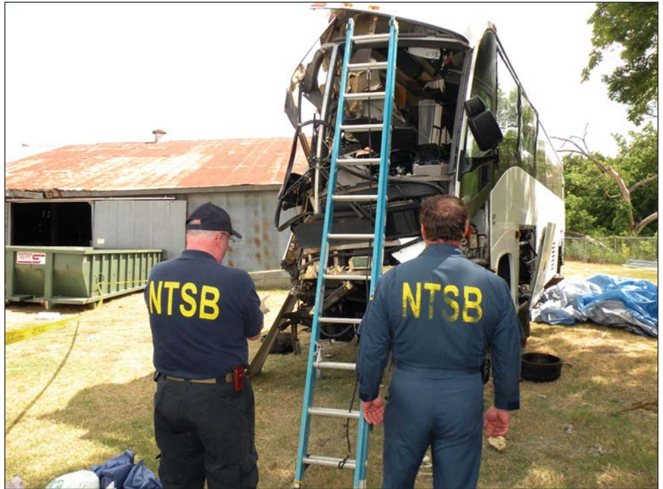
Figure 4: Two NTSB Investigators Assess Motorcoach Wreckage