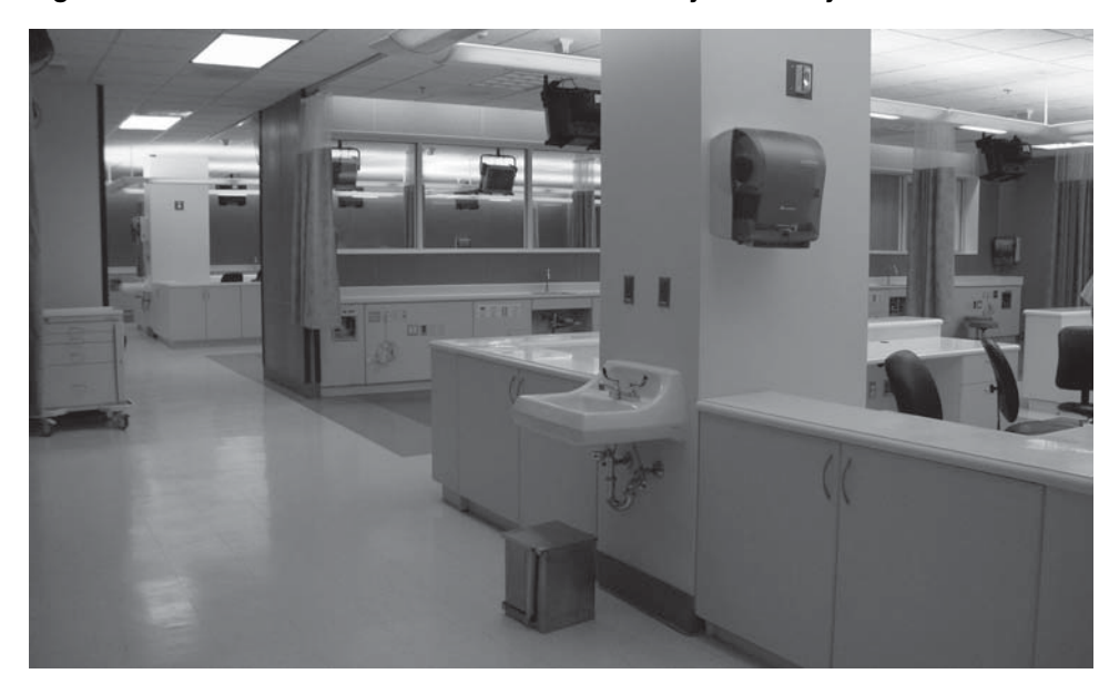
Figure 4: Unused Commonwealth Health Center Dialysis Facility