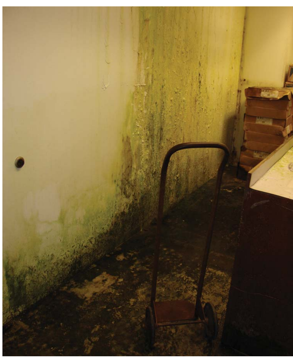
Figure 6: Rota Health Center Loading Area with Significant Mold