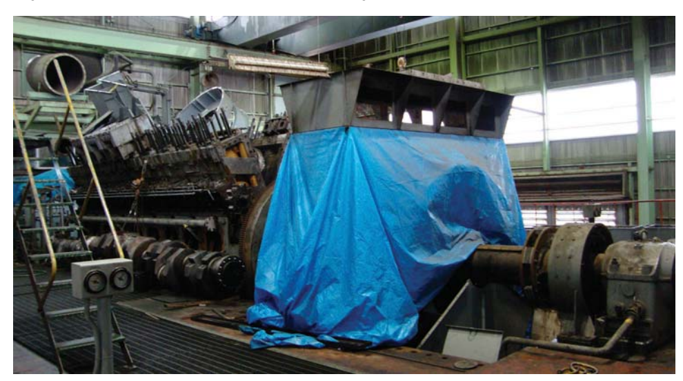
Figure 5: An Unused Saipan Power Plant Engine

their jobs at the agency.<sup>2</sup> Further, the Commonwealth Utilities Corporation reported that because roughly 70 percent of the agency's budget is spent on fuel, it is vulnerable to rising fuel prices. This can add to the challenge of estimating project budgets. The Commonwealth Utilities Corporation has responded to fuel cost fluctuations in the past by diverting funds away from its periodic maintenance and required engine overhauls, which increases the risk for future engine failures.