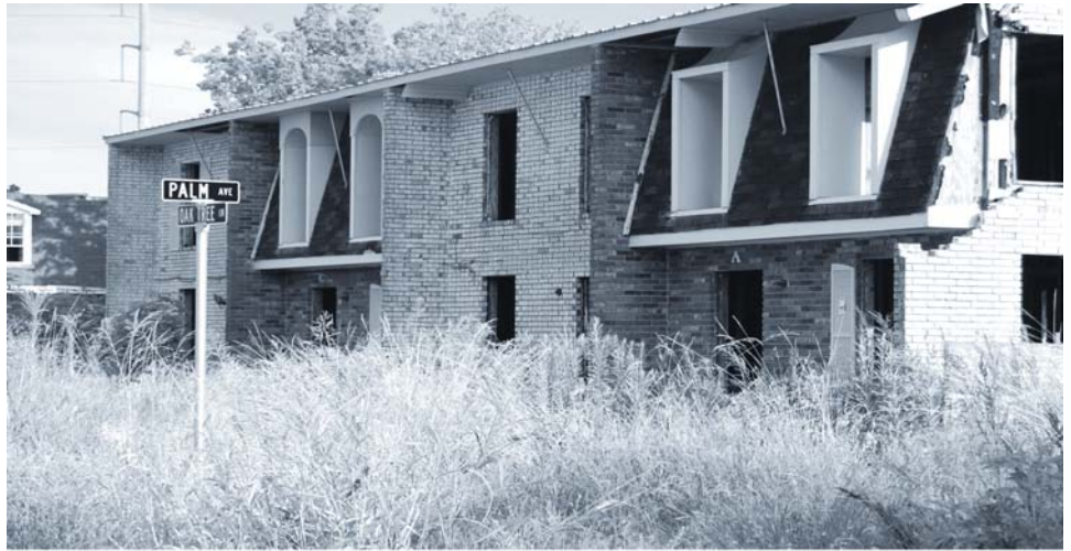
Figure 3: Replacement Street Signs Facilitated Address Canvassing in New Orleans