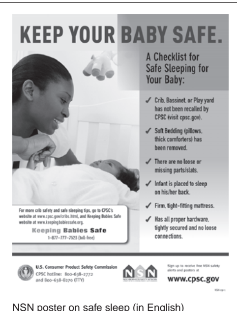
Figure 4: Examples of CPSC Consumer Information