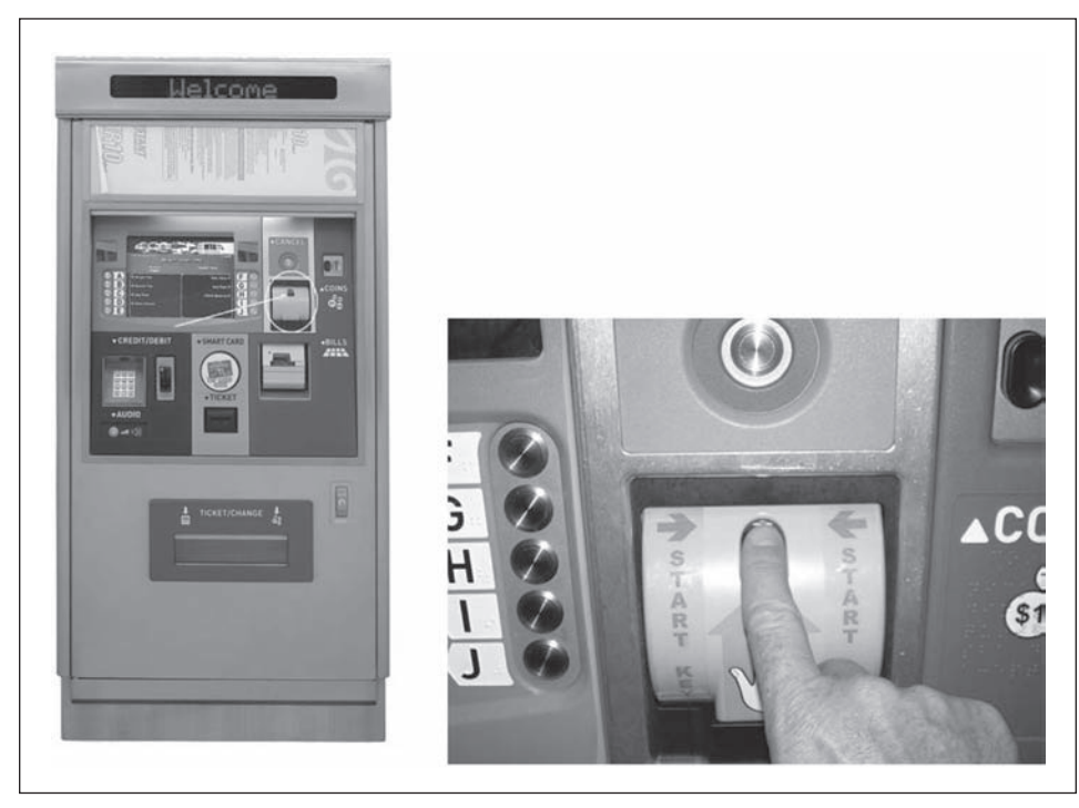
Figure 3: Photo of DHS S&T Pilot Technology for a Fare Card Vending Machine with Explosive Trace Detection Capability