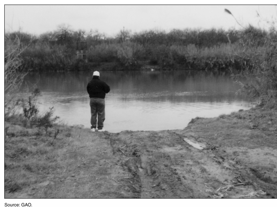
Figure 4: GAO Investigator at a U.S.-Mexico Border Location

An individual who worked in this area told our investigators that at several times during the year, the water is so low that the river can easily be crossed on foot. Our investigators were in this area for 1 hour and 30 minutes and observed no surveillance equipment, intrusion alarm systems, or law enforcement presence. Our investigators were not challenged regarding their activities. According to CBP officials, in some locations on federally managed lands, social and cultural issues lead the U.S. Border Patrol to defer to local police in providing protection. This sensitivity to social and cultural issues appears to be confirmed by the provisions of the memorandum of understanding between DHS, Interior, and USDA.