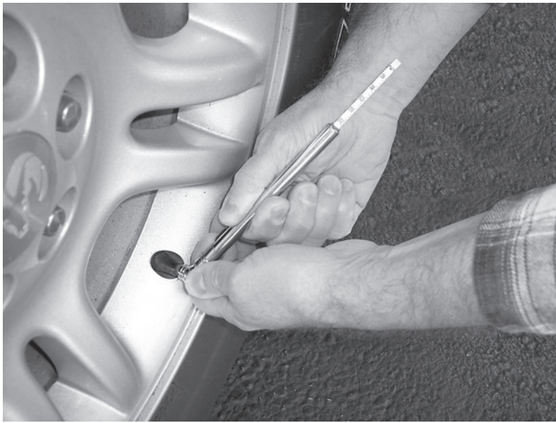
Figure 2: Two Types of Tire Pressure Gauges