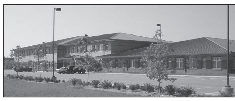
Figure 1: Armed Forces Reserve Center, Greenville, North Carolina