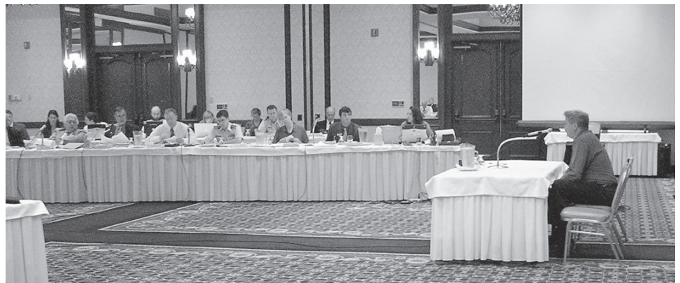
Figure 1: Public Testimony before the Pacific Fishery Management Council