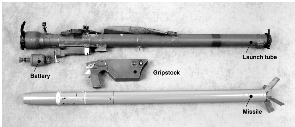
Figure 1: Components of Stinger MANPADS

The United States government requires that U.S.-produced MANPADS be sold through the FMS program, rather than commercially, 4 because the U.S.-produced version of MANPADS—the Stinger missile system (see fig. 1)—is among the most advanced of all MANPADS produced worldwide. Since 1982, the United States government has sold more than 20,000 Stinger missiles to 17 foreign countries and Taiwan. In addition, the United States has licensed Raytheon and several subcontractors to sell spare parts for Stinger missile systems to these same countries and to foreign companies.