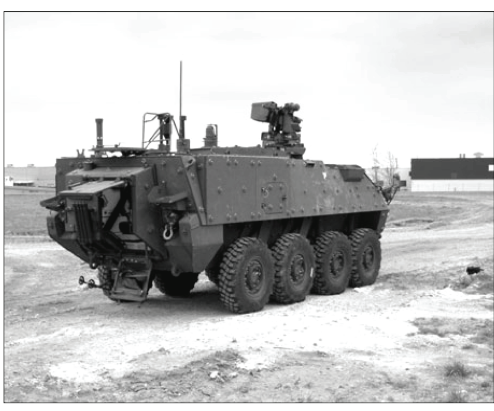
Figure 3: The Nuclear Biological Chemical Reconnaissance Vehicle Is One of Two Developmental Configurations

The Army selected one light infantry brigade and one mechanized infantry brigade at Fort Lewis, Washington, to become the first two of six planned Stryker brigades. The first of these brigades, the 3rd Brigade, Second Infantry Division, became operational in October 2003, at which time the Brigade was deployed to Iraq. The second of the two Fort Lewis brigades became operational in May 2004, and plans are for it to deploy to Iraq in late 2004. The Army plans to form four more Stryker brigades from 2005 through 2008. The planned locations of the next four brigades are Fort Wainwright/Fort Richardson, Alaska; Fort Polk, Louisiana; Schofield Barracks, Hawaii; and a brigade of the Pennsylvania Army National Guard.