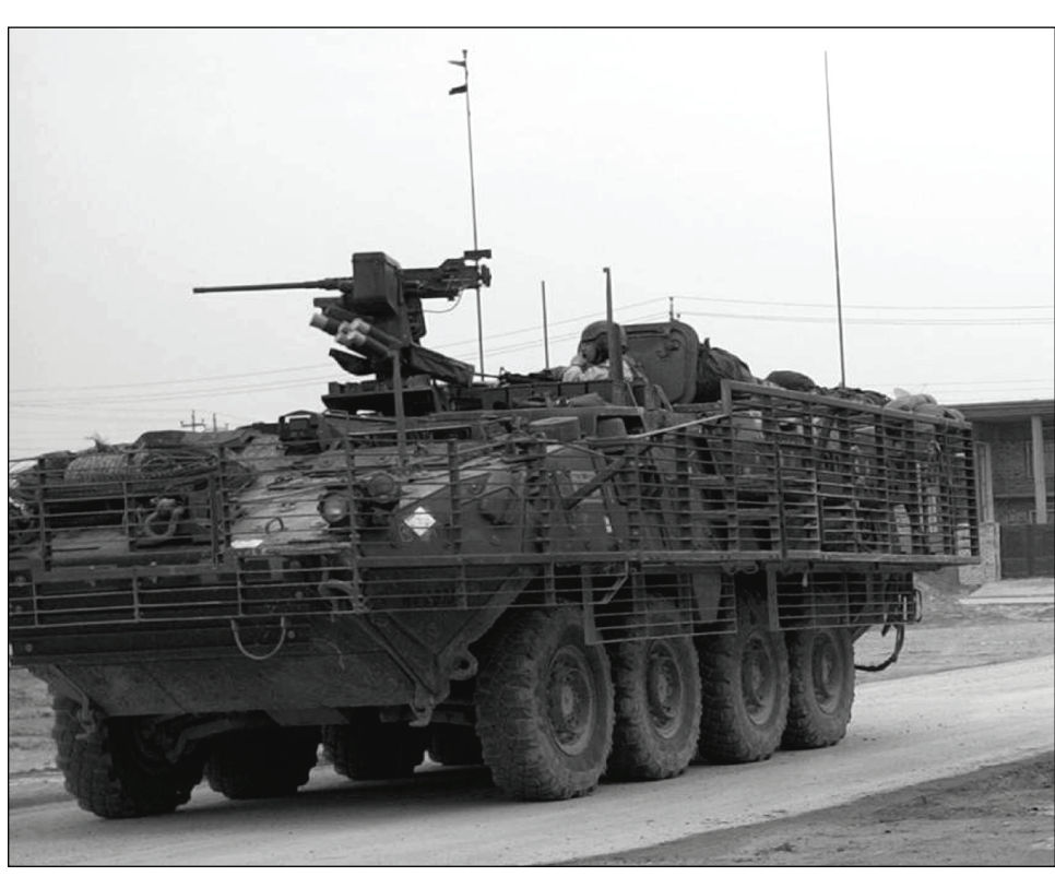
Figure 6: Stryker Vehicle with Slat Armor in Iraq

The addition of armor to the Strykers would pose additional challenges. With removable armor added to Strykers, the vehicles will not fit inside a C-130. To provide interim protection against rocket-propelled grenades, the Stryker vehicles of the brigade that deployed to Iraq in October 2003, were fitted with Slat armor weighing about 5,000 pounds for each vehicle (see fig. 6). By 2005, the Army expects to complete the development of add-on reactive armor—weighing about 9,000 pounds per vehicle—for protection against rocket-propelled grenades. With either type of armor installed, a Stryker vehicle will not fit inside a C-130 aircraft cargo bay. Regardless, with the added weight of the armor even in ideal flight conditions, the aircraft would be too heavy to take off.