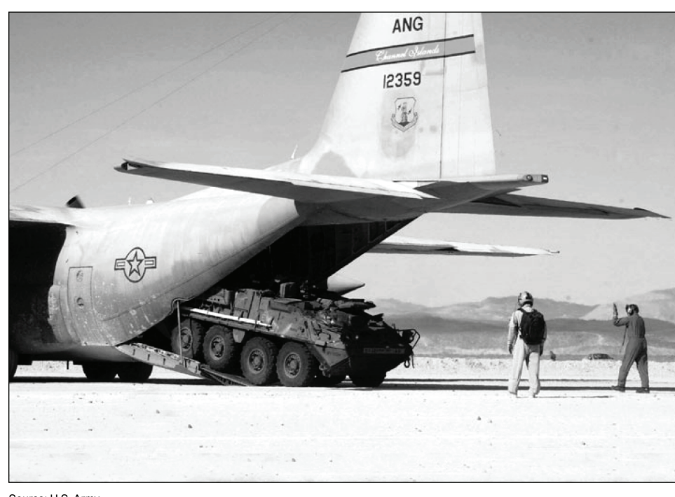
Figure 4: Stryker Vehicle Exiting a C-130 Aircraft at the National Training Center

A team from the Department of Defense's (DOD) Office of the Director for Operational Test and Evaluation and the Army's Test and Evaluation Command also observed the Stryker vehicle's deployment and recorded the weight of the vehicles and the total load weight onboard the aircraft. The average weight for the eight production vehicle configurations was just less than 38,000 pounds, while the total load weight—including a 3-days' supply of fuel, food, water, and ammunition—averaged more than 39,100 pounds. Table 6 shows the weight of eight-production vehicles and their total load weight recorded at the time of the April 2003 National Training Center deployment. We noted in our December 2003 report, however, that while the tactical deployment of Stryker vehicles by C-130 aircraft was demonstrated, the Army had yet to demonstrate under various environmental conditions, such as high temperature and airfield altitude, just how far Stryker vehicles can be tactically deployed by C-130 aircraft.