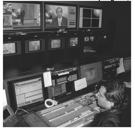
Alhurra's Broadcast Center in Springfield, Virginia

In response to our recommendations on the Board's strategic planning and performance management efforts, the Board revised its strategic plan to make reaching large audiences in strategic markets the centerpiece of its performance reporting system. The Board also added broadcaster credibility and audience awareness to its array of performance measures and plans to add a measure of whether VOA is meeting its mandated mission.