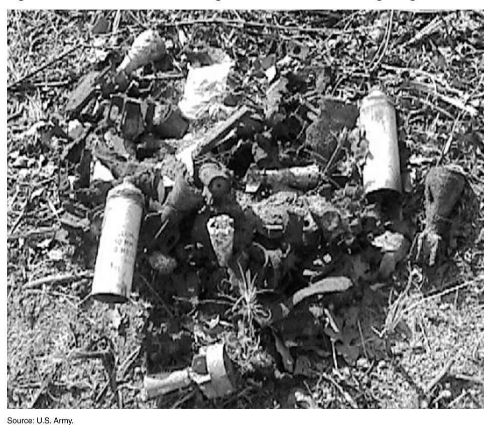
Figure 3: Munitions Debris, Including Ordnance, Collected during Range Clearance

Section 313(a)(1) of the National Defense Authorization Act for Fiscal Year 2002<sup>7</sup> required DOD to provide Congress with a comprehensive assessment of unexploded ordnance, discarded military munitions, and munitions constituents at current and former DOD facilities.<sup>8</sup> The law required the assessment to include an estimate of the aggregate projected cost of