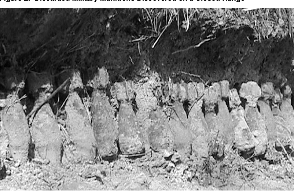
Figure 2: Discarded Military Munitions Discovered on a Closed Range