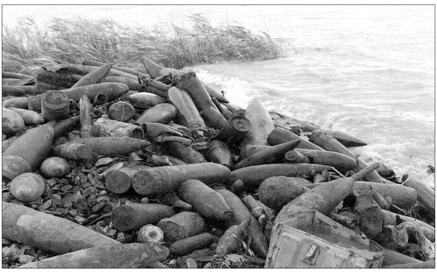
Figure 1: Discarded Munitions on an Operational Range That Were Later Uncovered by Erosion