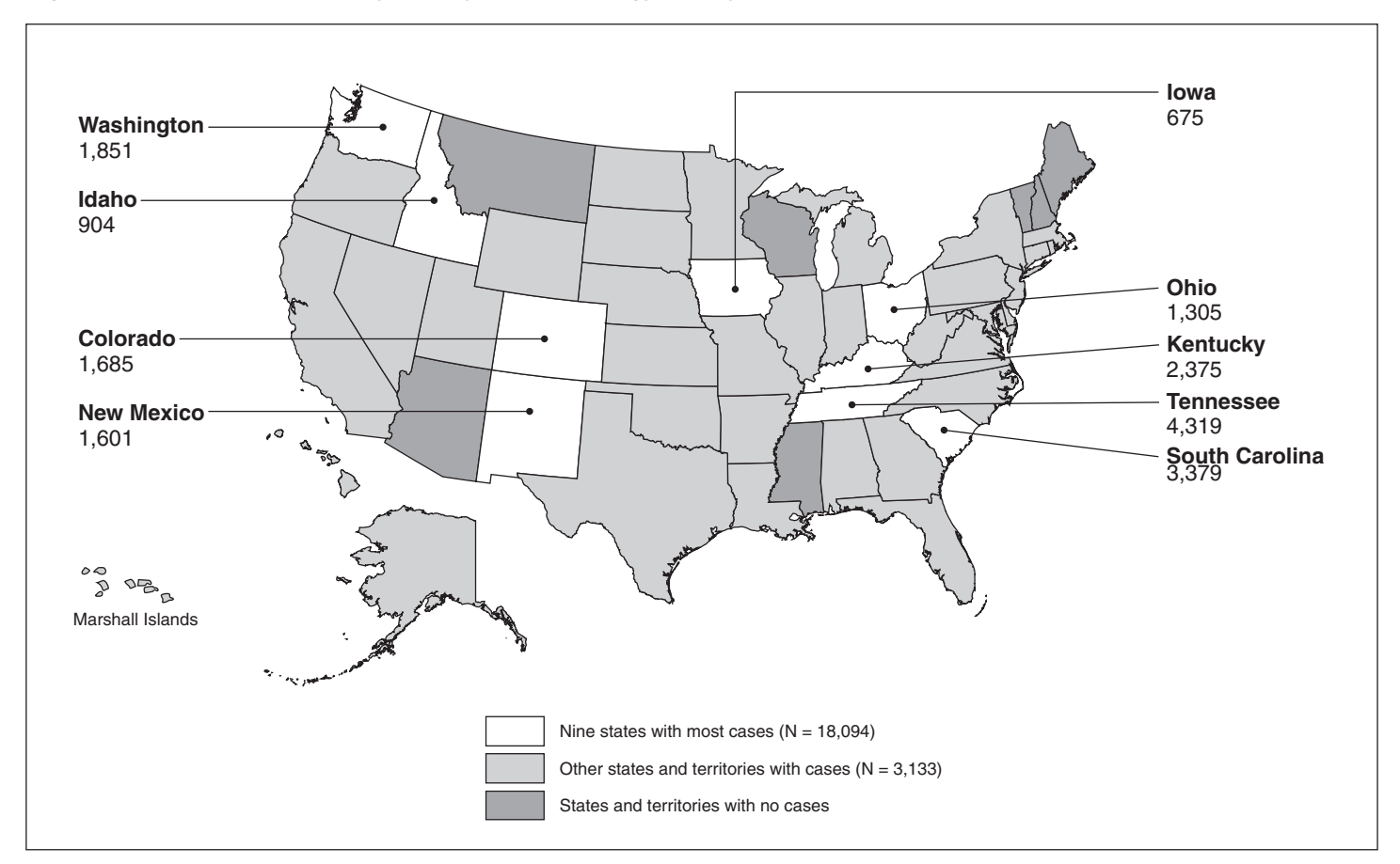
Figure 3: Distribution of Cases by Employee's Last Energy Facility Worked

While cases filed are associated with facilities in 43 states or territories, the majority of cases are associated with Energy facilities in 9 states, as shown in figure 3. Facilities in Colorado, Idaho, Iowa, Kentucky, New Mexico, Ohio, South Carolina, Tennessee, and Washington account for more than 75 percent of cases received by December 31, 2003. The largest group of cases is associated with facilities in Tennessee.