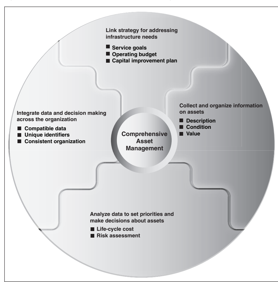
Figure 1: Elements of Comprehensive Asset Management