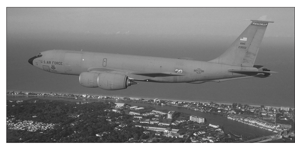
Figure 2: KC-135 Aerial Refueling Aircraft