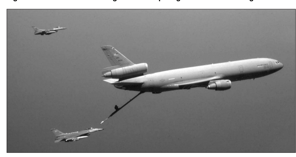
Figure 1: KC-10 Aerial Refueling Aircraft Preparing to Refuel an F-16 Fighter