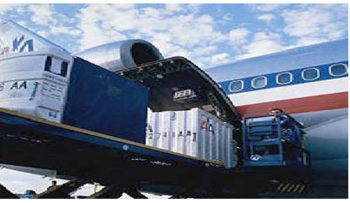
Air Cargo Remains Vulnerable to Terrorist Threats

TSA faces longer-term management and organizational challenges to sustaining enhanced aviation security that include (1) developing and implementing a comprehensive risk management approach, (2) paying for increased aviation security needs and controlling costs, (3) establishing effective coordination among the many entities involved in aviation security, (4) strategically managing its workforce, and (5) building a results-oriented culture within the new Department of Homeland Security. TSA has begun to respond to recommendations we have made addressing many of these challenges, and we have other studies in progress.