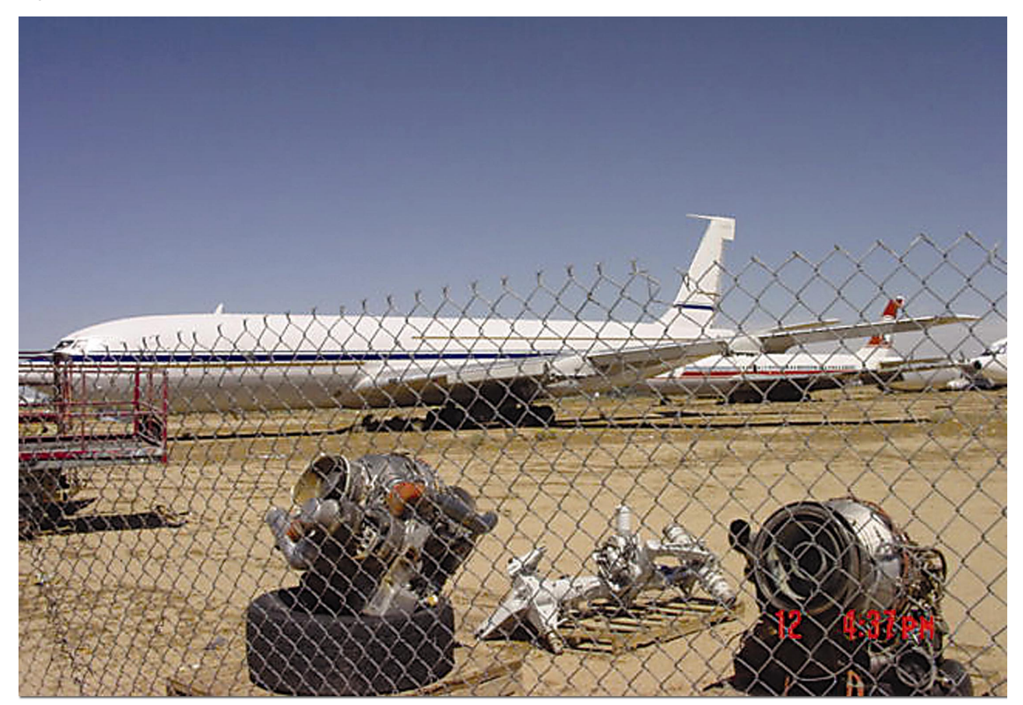
Figure 4: Airport Perimeter