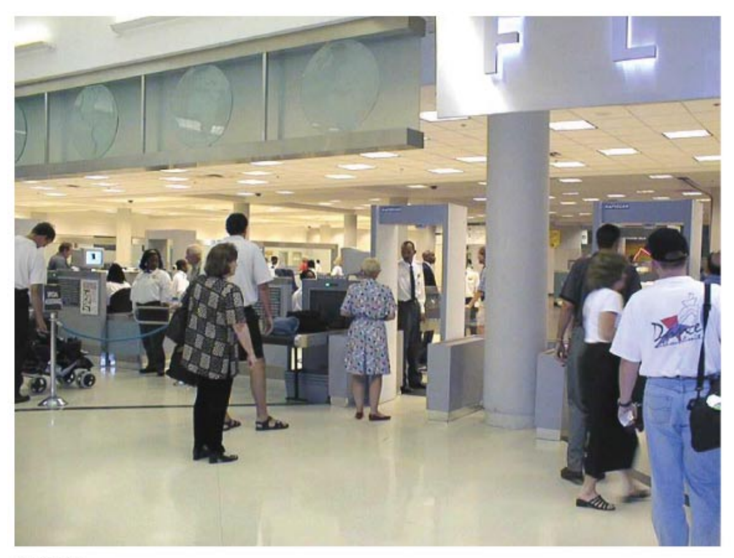
Figure 2: Screening Passengers at a U.S. Commercial Airport

In addition, according to FAA, U.S. and foreign airlines met the April 2003 deadline to harden cockpit doors on aircraft flying in the United States.