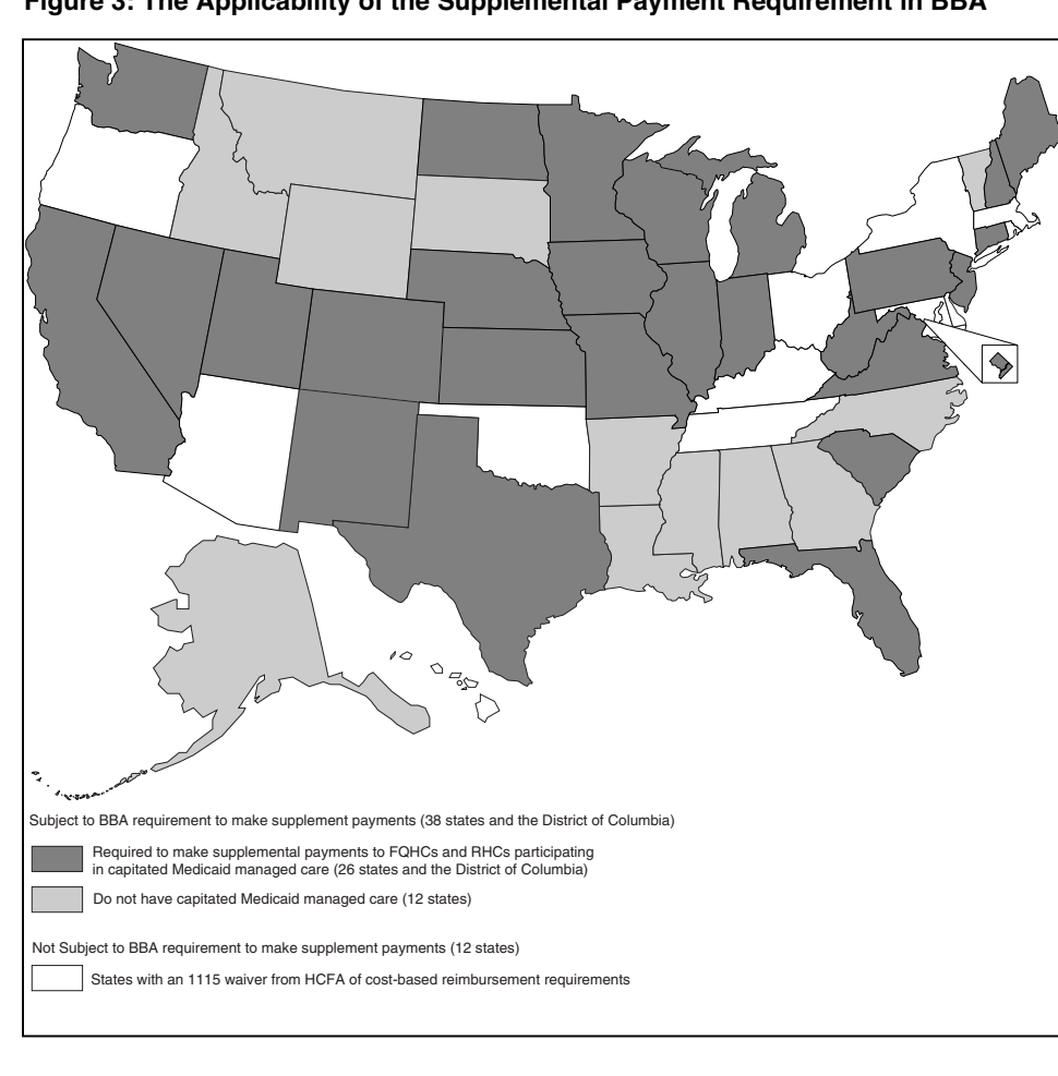
Figure 3: The Applicability of the Supplemental Payment Requirement in BBA