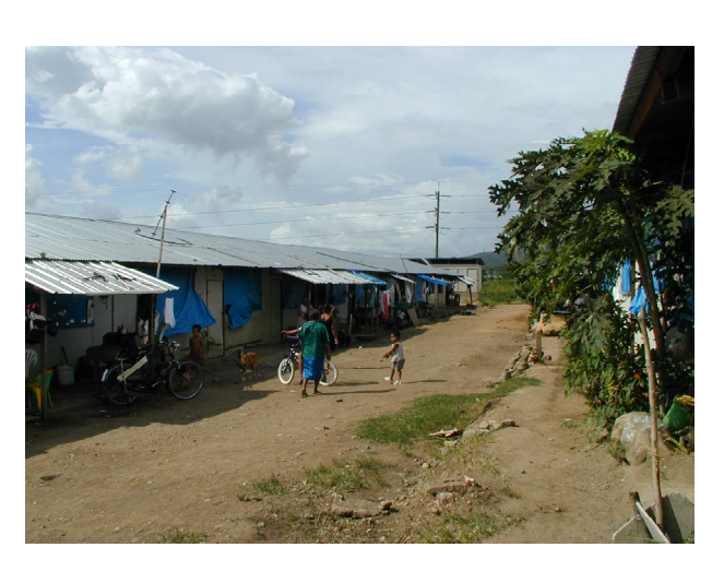
Figure 4: Temporary Shelters in El Progresso Compared to Housing Completed With Disaster Recovery Funds in El Pataste, Honduras

• As of March 15, 2001, according to mission estimates, USAID's cooperating partners completed 2,072 houses, and another 2,825 were under construction. USAID had originally planned to complete about 5,000 houses, but now estimates that it may complete 5,100 or more. Most temporary shelters have been dismantled as families have moved into permanent housing. (See figure 4.) We observed many of these houses in different areas of the country and talked with the residents of completed units. In many cases, the houses are better than the ones they lost to the hurricane.