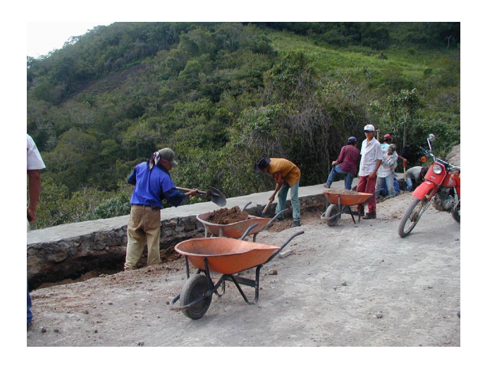
Figure 7: Construction of Retaining Walls and Culverts Near Jinotega, Nicaragua