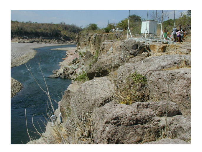
Figure 5: River Gauge Near Choluteca, Honduras