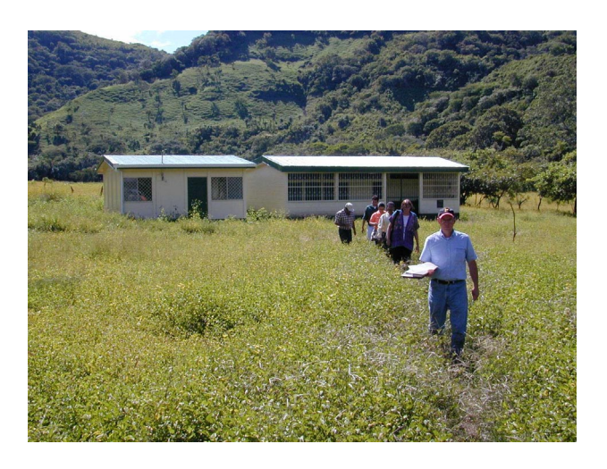
Figure 12: Rural Health Facility Near Matagalpa, Nicaragua

lack of support. In January 2001, we returned to the clinic unannounced and found that a doctor was present and living at the residence and the clinic was operating. He had been assigned following our earlier visit. (See figure 12.)