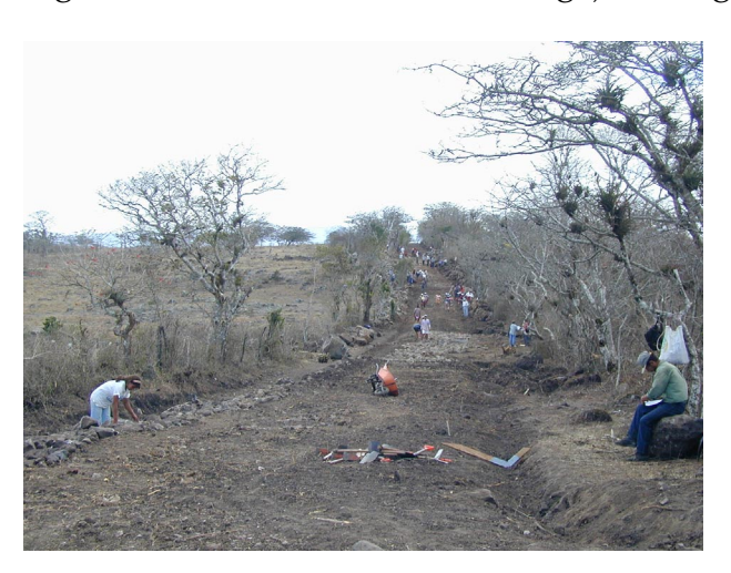
Figure 11: Rural Road Near Jinotega, Nicaragua

• A GAO team visited numerous sites where an international private voluntary organization was implementing cash-for-work rural road rehabilitation projects. We pointed out several deficiencies in the quality of the work, including (1) roads not properly crowned to prevent standing water, (2) ditches not adequately dug to facilitate drainage of water, and (3) roadbed materials not suitable for withstanding traffic and weather. Based on our comments, as well as input from the U.S. Army Corps of Engineers and others, the private voluntary organization hired engineers to oversee road activities. We observed a noticeable improvement in this organization's road projects on subsequent visits. (See figure 11.)