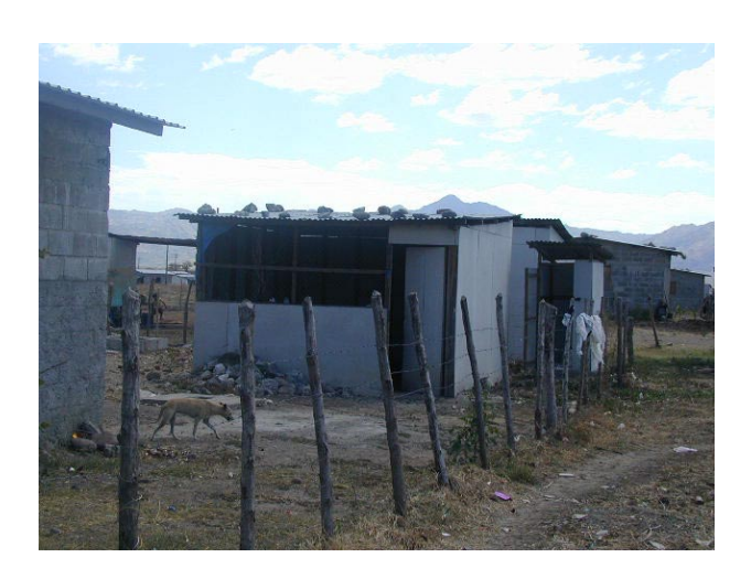
Figure 10: Houses in Limon de la Cerca, Honduras

Twelve nongovernmental organizations representing a variety of international donors built 1,126 houses for families who lost their homes in Mitch floods. USAID funded a temporary health clinic and a vocational training center. USAID is also funding a potable water and sewer system for the planned community; the residents have a temporary water supply and latrines in the meantime. However, because such services are not complete or are inadequate to support the community, many houses remain unoccupied and some families have moved elsewhere. Crime is increasing and some residents are stealing materials from unoccupied houses. According to USAID officials, these problems stem partly from the rush of donors to finish houses and the fact that community leadership has been divided among the different areas developed by nongovernmental organizations, with the unintended result of setting up separate communities. (See figure 10.) USAID is optimistic that the community will become more viable as more families move in following completion of the water system and the rest of the houses. However, USAID officials also noted that experienced developers are needed for these large sites to help ensure that attention is paid to overall infrastructure and services.