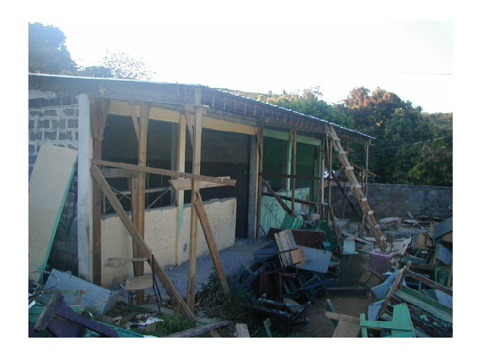
Figure 6: School Under Repair Near La Ceiba, Honduras