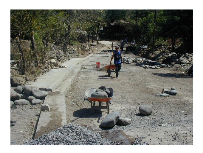
Figure 2: Cobblestone Road Project in Pespire, Honduras

• USAID financed the repair of 625 kilometers (390 miles) of secondary roads and 1,231 meters of bridges as of February 28, 2001. USAID is also financing 15 kilometers (9 miles) of cobblestone roads. We have traveled a good portion of these roads both before and after the repairs and observed the improvements. USAID plans to repair 1,250 kilometers (775 miles) of roads and 5,220 meters of bridges. The total bridge repair program consists of 106 bridges and 145 low-level crossings. USAID had originally targeted 2,000 kilometers of road repairs but revised it due to higher than estimated unit costs and the increase in bridge work, which was increased from 2,000 meters. When completed, this program is expected to connect two million people in 375 communities in six departments with secondary cities and commercial centers. (See figure 2.)