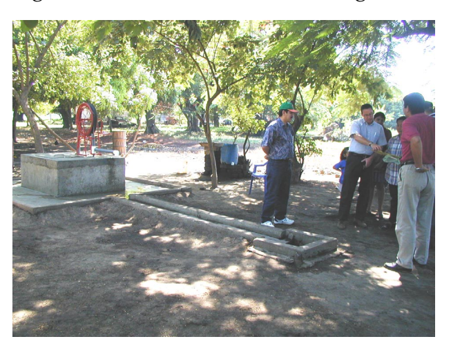
Figure 8: Well Sites in Rural Nicaragua

• In the public health sector, USAID plans to build or repair 2,550 water wells, 5,640 latrines, 28 health centers, and 32 rural health posts as well as provide job training and health education to families in remote areas affected by Hurricane Mitch. As of December 31, 2000, USAID, through its partners, had built or repaired 1,034 wells and 3,800 latrines. USAID-funded drilling rigs had also drilled 87 deep wells. USAID expects to exceed its original target of 160 drilled wells by as many as 100. Also, three health centers were nearly complete and land for three more has been secured, seven rural health posts had been built, and the Matagalpa hospital was rehabilitated. We observed numerous repaired wells, latrines, and health centers and posts. (See figure 8.)