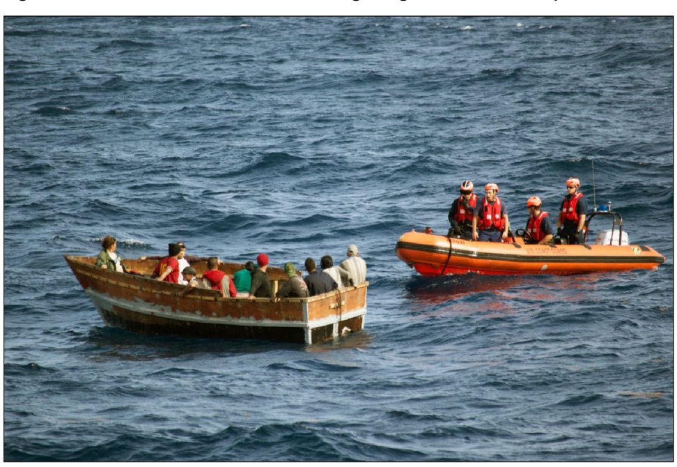
Figure 2: Coast Guard Personnel Conducting a Migrant Interdiction Operation

the U.S.; detect and interdict migrants and smugglers far from the U.S. border; and expand Coast Guard participation in multi-agency and binational border security initiatives. The Coast Guard interdicted more than 12,000 migrants in both fiscal year 2022 and 2023—more than double the fiscal year 2021 total, according to Coast Guard data.<sup>5</sup> The U.S. is currently experiencing an increase in migrants entering the country by sea. Global international migration is likely to continue and potentially accelerate over the next decade, according to the National Academy of Sciences.<sup>6</sup> Figure 2 shows Coast Guard personnel conducting a migrant interdiction operation.