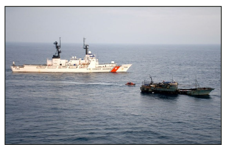
Figure 3: Coast Guard Vessel Interdicting Illegal Fishing and Officials Preparing to Conduct a Law Enforcement Boarding

plastics and other marine debris. IUU fishing encompasses many illicit activities, including under-reporting the number of fish caught and using prohibited fishing gear. In fiscal year 2022, the Coast Guard boarded 81 foreign vessels to suppress IUU fishing, according to the Coast Guard's fiscal year 2024 posture statement. Figure 3 below shows a Coast Guard vessel interdicting a vessel using an illegal high seas driftnet, and Coast Guard officials preparing to conduct a law enforcement boarding. According to the Coast Guard IUU Strategic Outlook, IUU fishing has replaced piracy as the leading global maritime security threat that if unchecked could threaten geo-political stability around the world.<sup>7</sup>