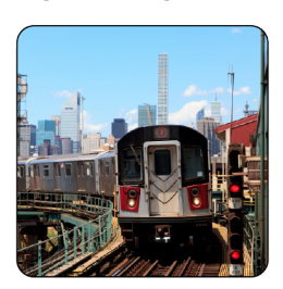
Figure 1: Higher-Risk Surface Transportation Assets by Mode, According to the Transportation Security Administration (TSA)

TSA does not have a singular definition or set of criteria for identifying "high-risk surface transportation assets." According to TSA officials, it considers public transportation and passenger railroads, freight railroads, and over-the-road buses "higher-risk" if they meet the criteria identified in federal regulations. Specific criteria for what is considered higher-risk differ for each mode of transportation, but are used to identify operations with a relatively higher risk of being targeted or used by terrorists. <sup>14</sup> For pipelines, TSA uses criteria, including the amount of throughput in the pipeline system and its use in other critical sectors, to determine if a pipeline is "critical," and thus, higher-risk (see figure 1).