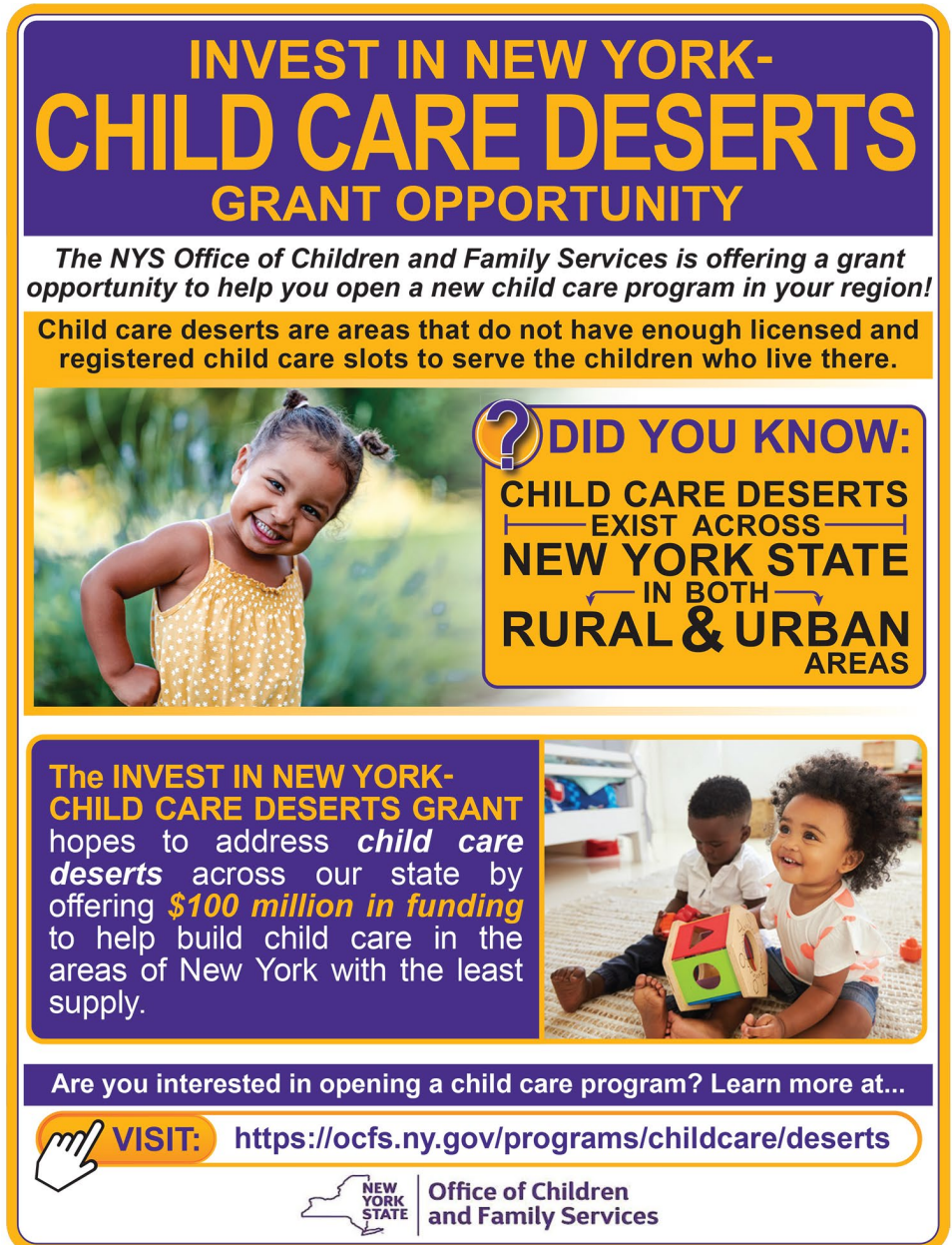
Figure 2: Example of New York State (NYS) Child Care Grant Opportunity Notice

GAO-24-106258