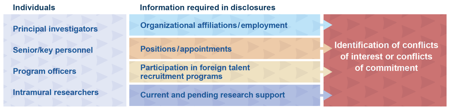
Figure 1: Overview of Disclosure Requirements for Participants in the Research and Development Enterprise as Specified in National Security Presidential Memorandum-33 (NSPM-33) and Implementation Guidance

GAO-24-106074