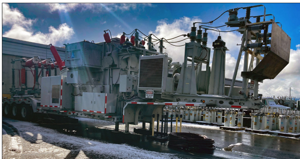
Figure 3. Example of a Mobile Substation

Given the challenges above, managing a limited inventory that may not meet demand for every utility would require decisions about who receives a transformer in an incident where multiple utilities suffer losses. However, smaller utilities we spoke with suggested that a strategic federal reserve of mobile substations—which include transformers—could provide a temporary stopgap while utilities acquired permanent replacements (see fig. 3 below for an example). Some of these officials told us that establishing a federal inventory of mobile substations would still face some of the challenges described above, depending on its configuration. Furthermore, utility officials described other ways the federal government could ensure adequate transformer reserves. For example, some officials suggested that federal entities, such as the power marketing administrations, could securely store privately owned spares on their property. Others suggested that the federal government could survey utilities to develop and share a comprehensive list of available spares nationwide.