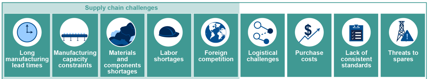
Figure 2. Challenges for Electric Utilities Attempting to Ensure Adequate Reserves of Transformers

Sources: GAO analysis of information from the Departments of Commerce and Energy and selected industry stakeholders. | GAO-23-106180