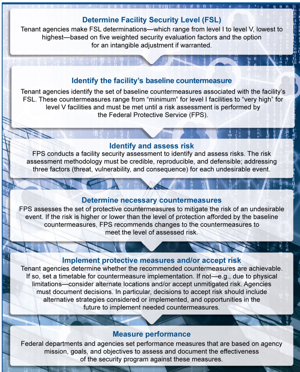
Figure 1: The Interagency Security Committee’s Risk Management Process

Source: GAO analysis of Interagency Security Committee information. Image Montri/stock.adobe.com. | GAO-23-105649