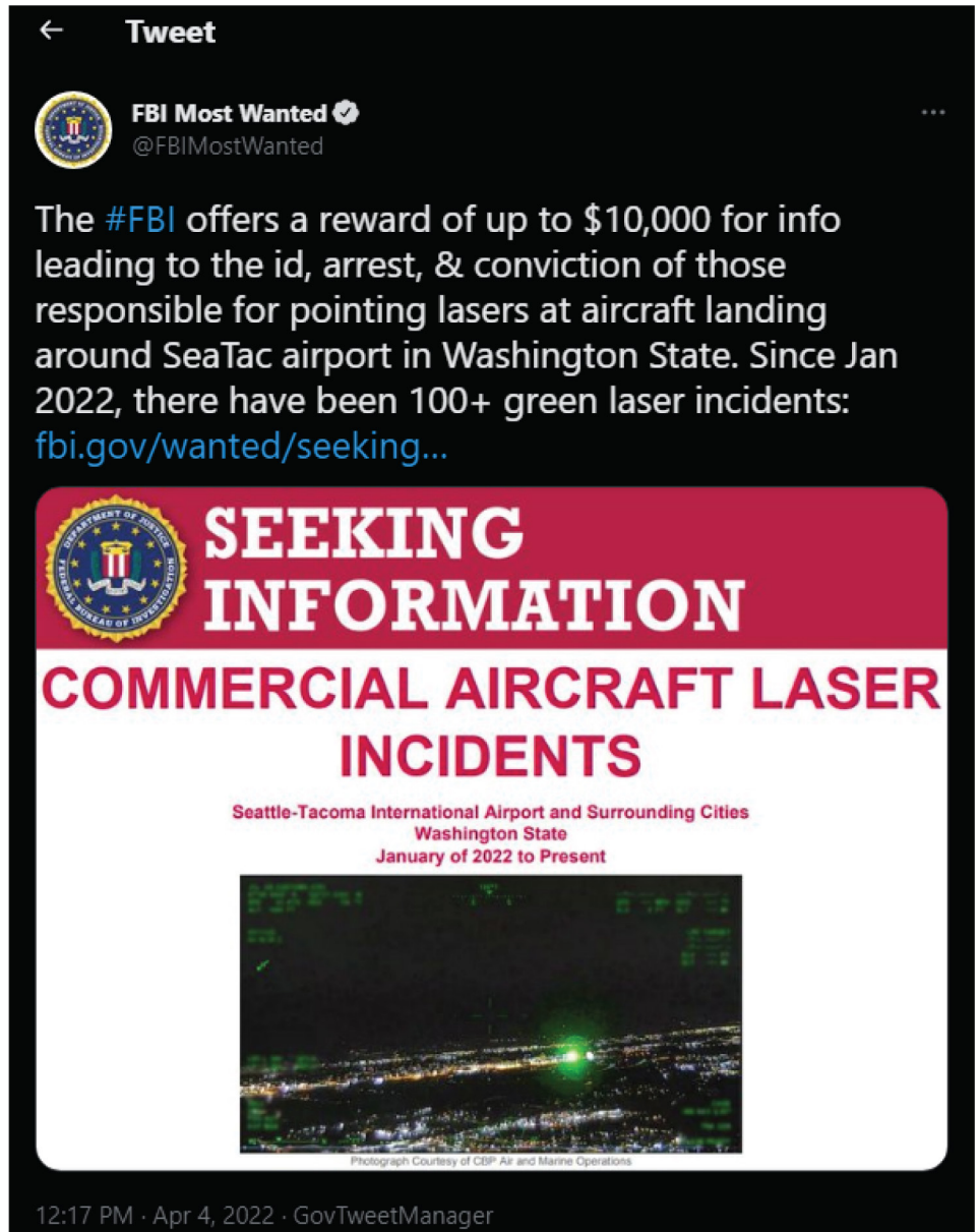
Figure 5: Federal Bureau of Investigation (FBI) Twitter Post Seeking Information on Laser Incidents

GAO-22-104664