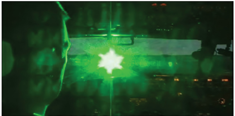
Figure 2: Example of the Effects of a Laser Pointer Aimed at an Aircraft Cockpit

Source: Federal Aviation Administration and Federal Bureau of Investigation. | GAO-22-104664