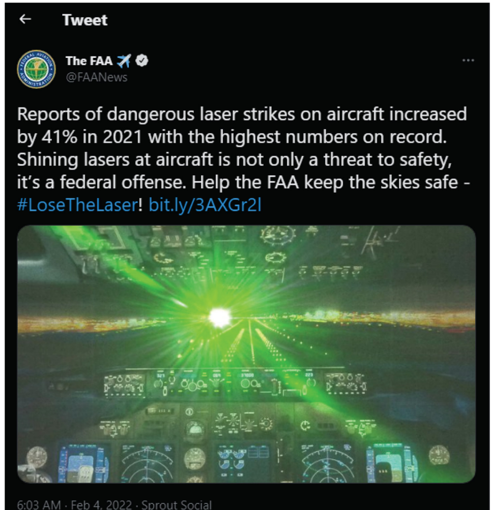
Figure 4: Federal Aviation Administration’s Twitter Post on the Dangers of Pointing Lasers at Aircrafts