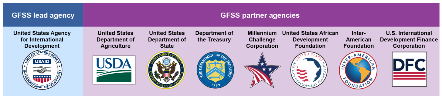
Figure 3: U.S. Agencies with Key Roles in Implementing the GFSS

Source: GAO analysis of documents related to the U.S. Government Global Food Security Strategy (GFSS). | GAO-22-104612