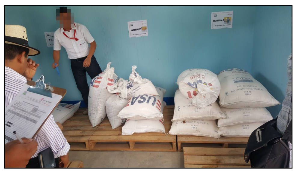
Figure 7: USDA School Feeding Project in Guatemala

their efforts. Officials from all U.S. entities providing food security assistance in Guatemala reported that the quality of their coordination efforts was either ideal or satisfactory.