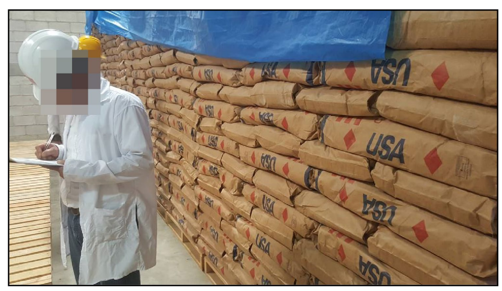
Figure 4: USDA Food Assistance in Guatemala

Figure 4 shows an example of a USDA food security assistance project in Guatemala.