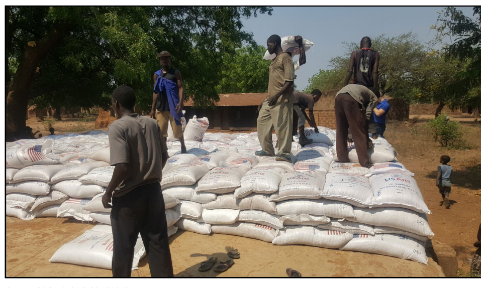
Figure 6: USAID Emergency Assistance in Malawi