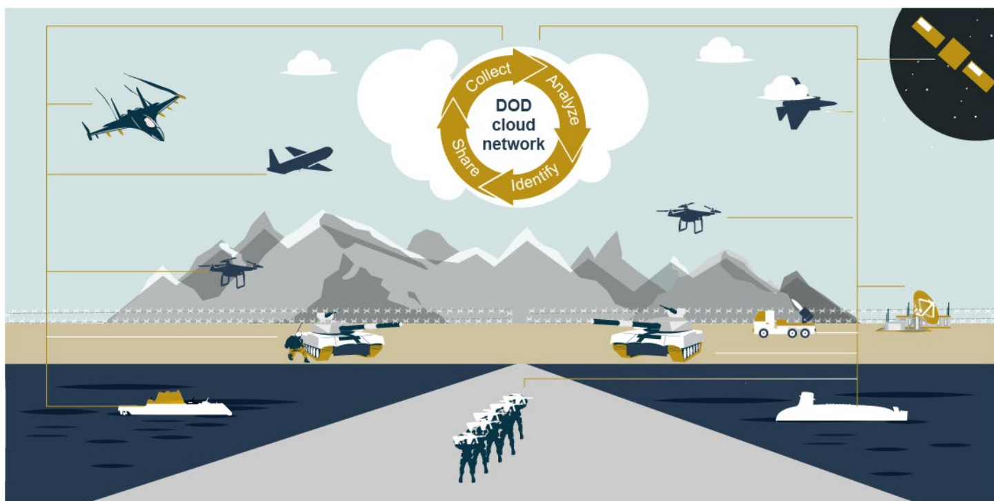
Figure 1: Example of Joint All-Domain Environment

Source: GAO analysis of Department of Defense information. | GAO-20-389