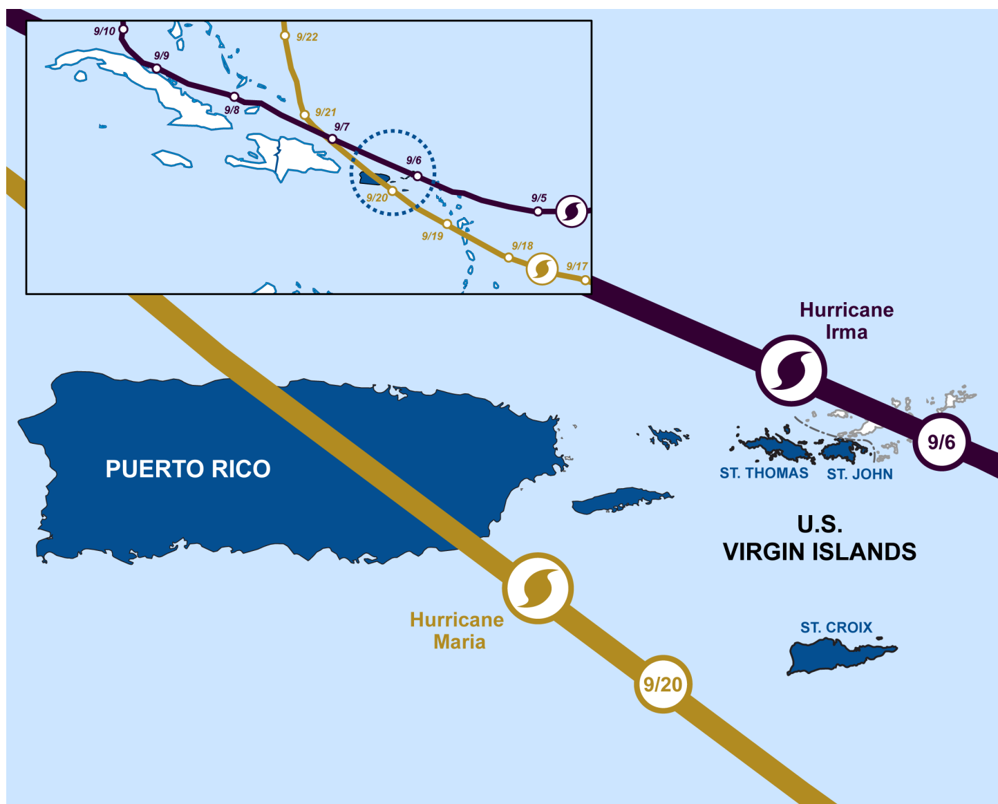
Figure 1: Paths of Hurricanes Irma and Maria in September 2017

Source: GAO analysis of National Oceanic and Atmospheric Administration (data); Map Resources (map). | GAO-19-592