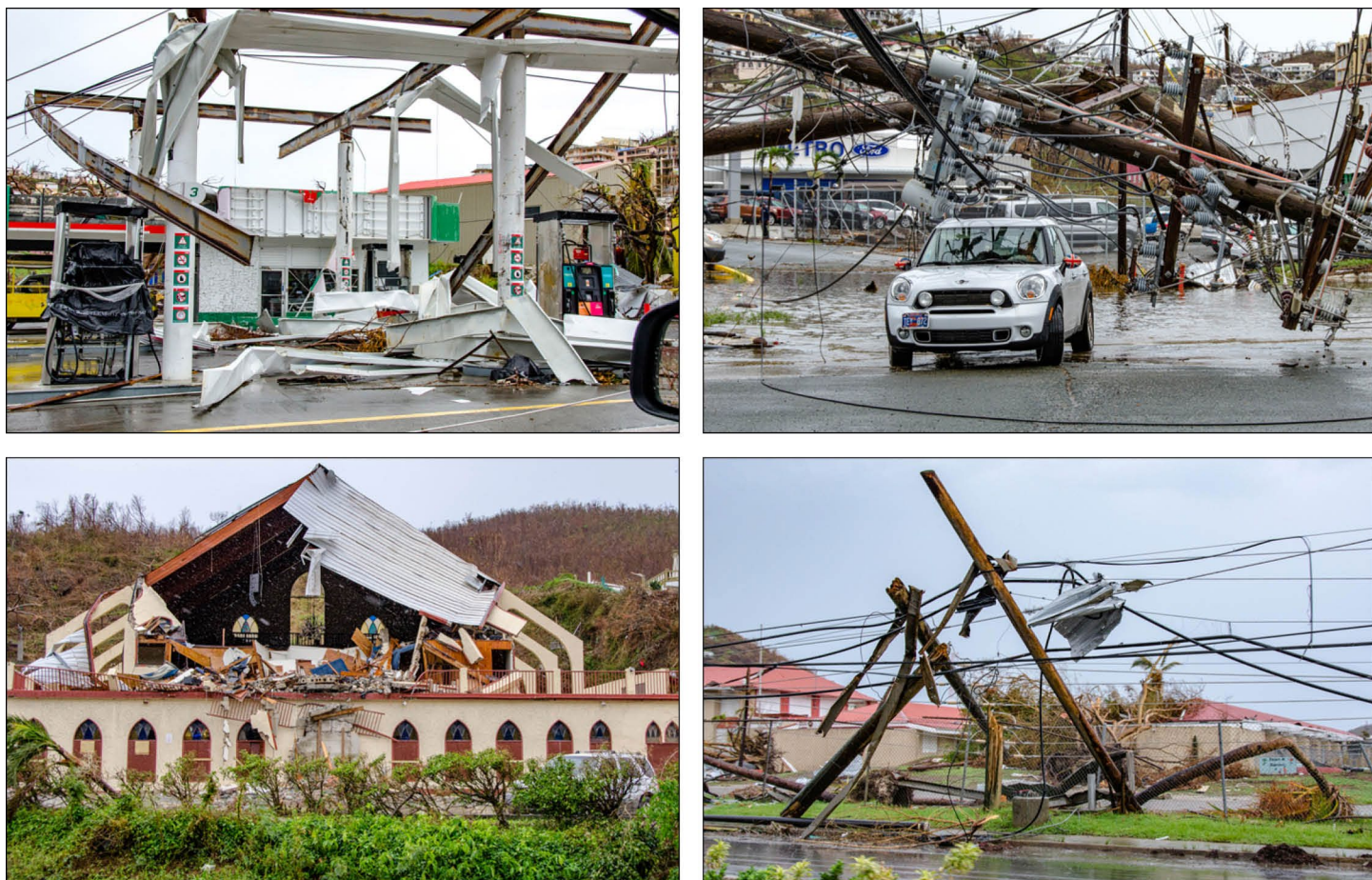
Figure 2: Damaged Gas Station, Church, and Power Lines in the U.S. Virgin Islands After Hurricane Irma in September 2017

GAO-19-592