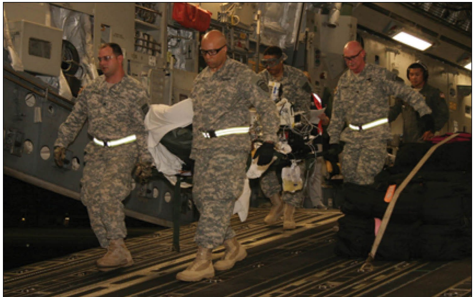
Figure 6: ASPR-led Evacuation of U.S. Virgin Islands Dialysis Patients to the Continental United States, September 2017

GAO-19-592