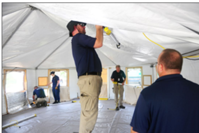
Figure 7: Department of Health and Human Services' Disaster Medical Assistance Team Setting Up a Temporary Medical Clinic in Puerto Rico, October 2017

figure 7 for photographs of Disaster Medical Assistance Teams setting up and providing services in Puerto Rico.