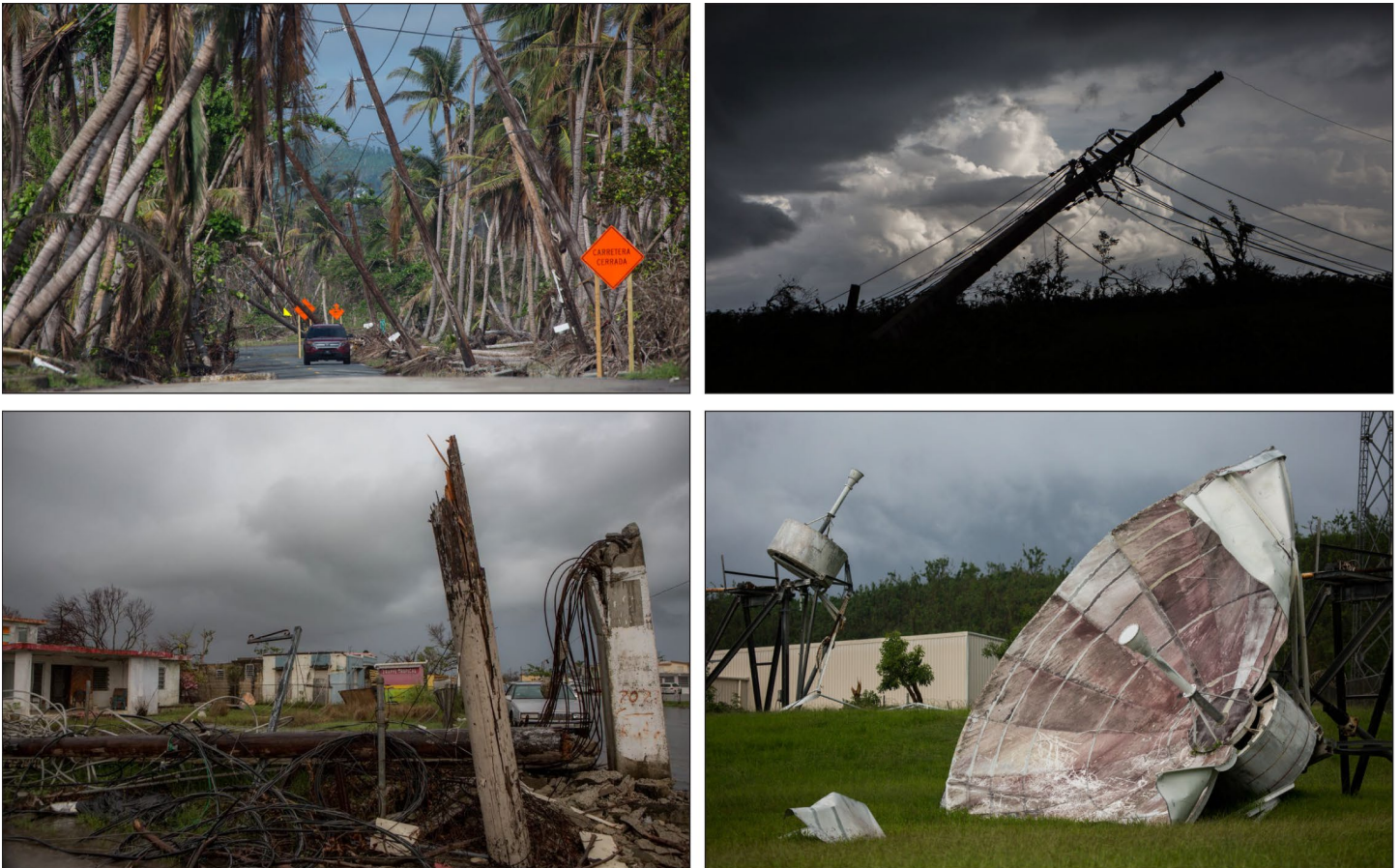
Figure 3: Damaged Power Lines and Satellite Dish in Puerto Rico After Hurricane Maria in November 2017

Source: Federal Emergency Management Agency. | GAO-19-592