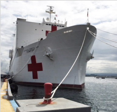
USNS Comfort in Puerto Rico in November 2017.

The USNS Comfort's primary mission is to provide an afloat, mobile, medical-surgical facility to the U.S. military that is flexible, capable, and uniquely adaptable to support expeditionary warfare. The ship's secondary mission is to provide full hospital services to support U.S. disaster relief and humanitarian operations worldwide.