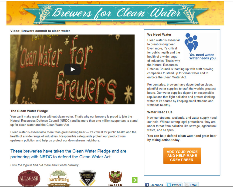
Figure 4: Screenshot of NRDC Webpage

an orange link button ("Add Your Voice and Help Make Great Beer") leading to an action page. We include below the NRDC webpage hyperlinked in the EPA blog.<sup>17</sup>