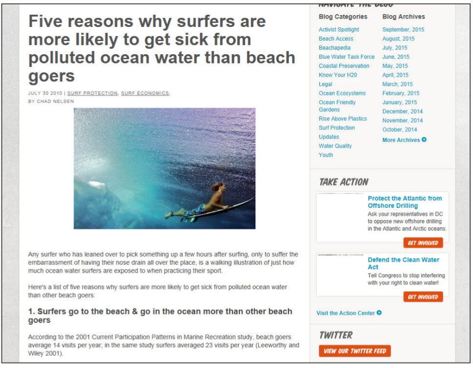
Figure 3: Screenshot of Surfrider Foundation Blog Post

goers."<sup>15</sup> In a column adjacent to the Surfrider blog post is a "Take Action" section containing a link button ("Get Involved") with the description, "Defend the Clean Water Act. Tell Congress to stop interfering with your right to clean water!" We include below the Surfrider Foundation blog post hyperlinked in the EPA blog.<sup>16</sup>