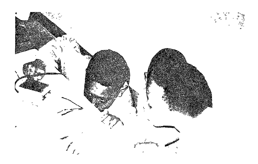
INTERN DISPLAYING AFRICAN MASK TO CHILDREN IN ETHNIC STUDIES CENTER.

CHILDREN PERFORMING EXPERIMENT IN ELEMENTARY SCIENCE CENTER,