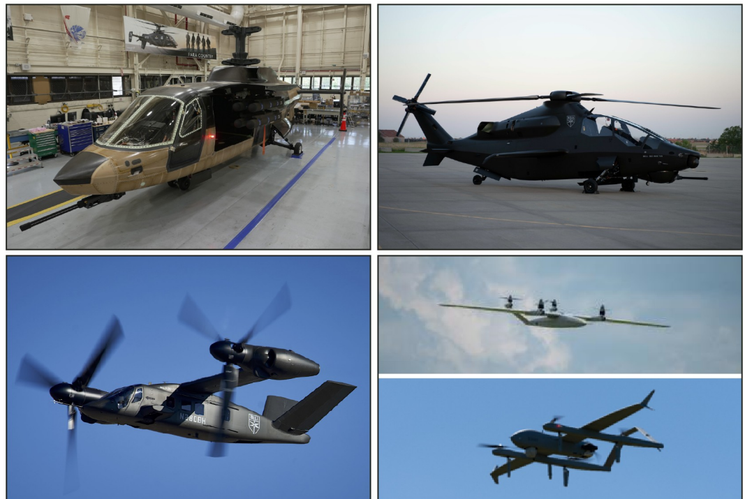
Top Row: Future Attack Reconnaissance Aircraft prototypes. Bottom Left: Future Long Range Assault Aircraft technology demonstrator. Bottom Right: Future Tactical Unmanned Aircraft System prototypes.

GAO-26-108025