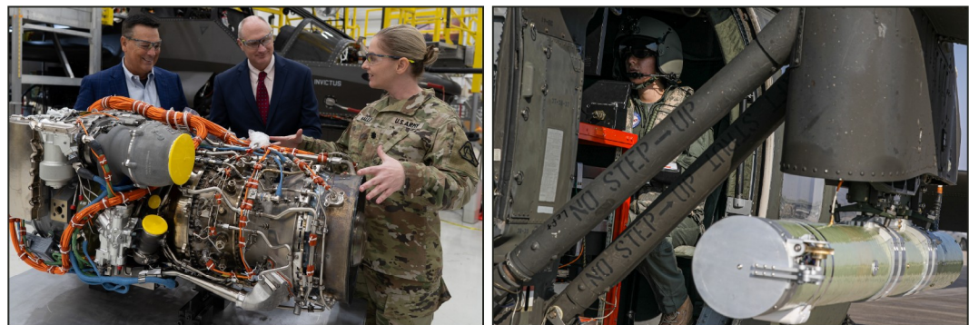
Figure 2: Improved Turbine Engine and Air Launched Effects

GAO-26-108025