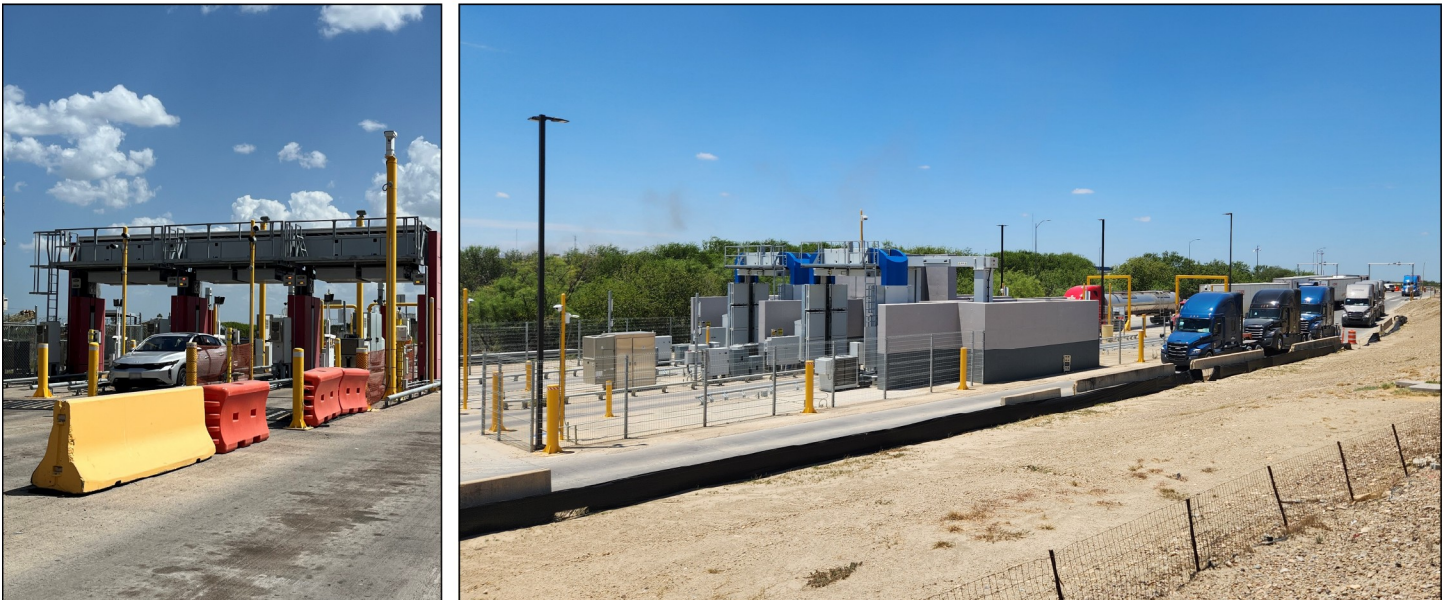
Figure 1: Non-Intrusive Inspection Systems in Passenger and Commercial Preprimary Inspection Areas at Land Ports of Entry in Mission, Texas (left) and Laredo, Texas (right)

CBP began using large-scale NII systems to scan vehicles in 1996 and has generally deployed them in secondary inspection areas at land POEs. When deployed in secondary inspection areas, they are only used to scan vehicles that were referred by CBP officers in primary inspection. In 2020, CBP began deploying new large-scale NII systems in preprimary inspection areas—before a traveler is interviewed by a CBP officer, where vehicles are scanned before they reach the primary inspection booth (see fig. 1). Previously, NII systems were generally used only when an officer determined that further inspection was required after the interview. Placing NII systems in preprimary inspection areas significantly increases the number of vehicles scanned because all vehicles approaching a primary inspection booth that do not choose to go through an opt-out lane are scanned, rather than only those referred for secondary inspection. 6