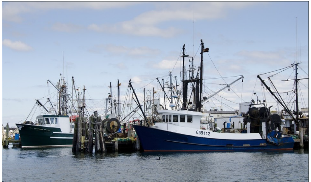
Figure 4 – Fishing Vessels at Port

Source: National Oceanic and Atmospheric Administration. | GAO-25-107447