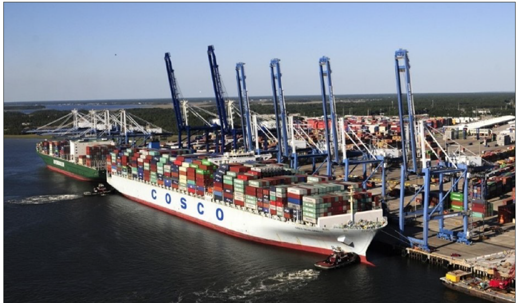
Figure 3 – Vessel Unloading Cargo at a Port

GAO-25-107447