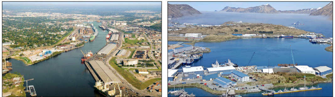
Figure 1 – Ports of Houston, Texas and Dutch Harbor, Alaska

Sources: U.S. Army Corps of Engineers and National Oceanic and Atmospheric Administration. | GAO-25-107447