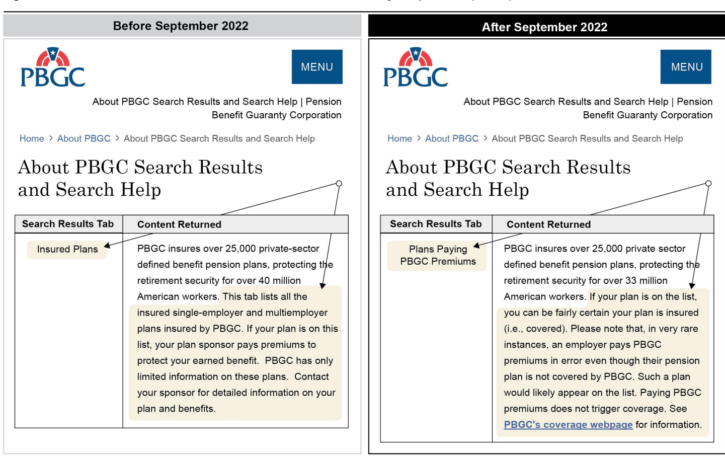
Figure 4: Search Results Revisions on the Pension Benefit Guaranty Corporation (PBGC) Website

Source: GAO review of PBGC web pages. | GAO-23-105080