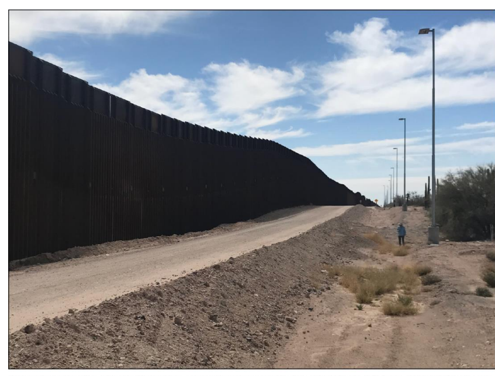
Figure 7: Raised Patrol Road above the Desert Floor in Arizona (May 2022)

Raised roadbed in Arizona impeding water flow from right side of photo to left (see GAO staff at base of light pole for scale)