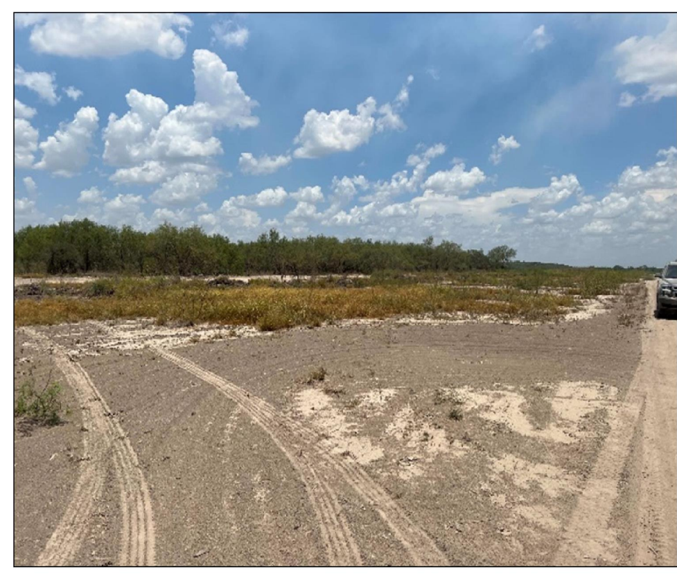
Figure 10: Barrier Project Site Cleared of Native Vegetation in Texas (July 2022)