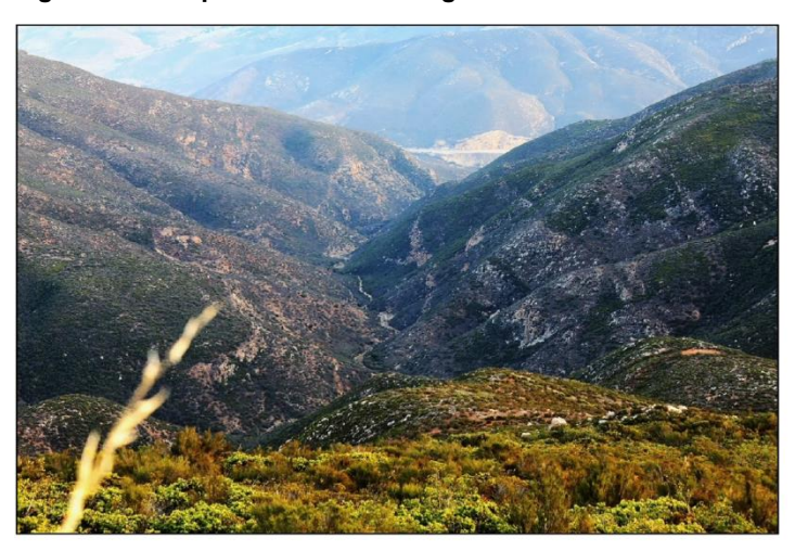
Hilly terrain with dense vegetation in California