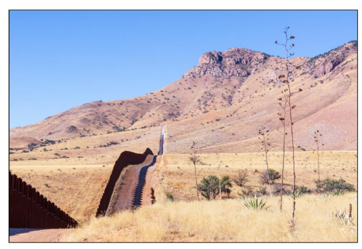
Desert mountain ranges and valleys in Arizona