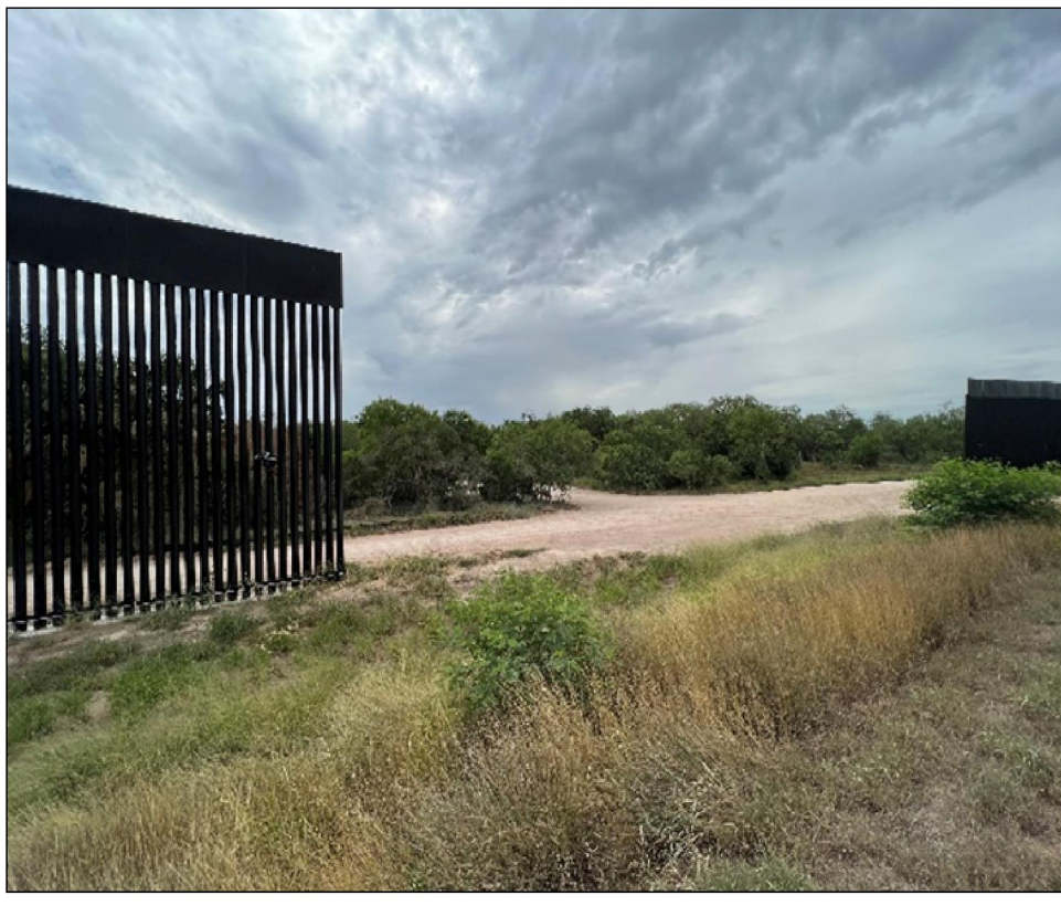
Figure 12: Opening Between Installed Panels in Texas (July 2022)

For example, FWS officials said they requested that CBP leave openings in the barrier at key wildlife crossings to facilitate wildlife movement, potentially securing those openings with additional technology. At the time, CBP determined that it could not leave the openings and still meet its operational requirements. However, now that the January 2021 pause in construction has resulted in several large openings between installed panels, the FWS officials said that CBP has an opportunity to determine if it can meet operational needs and better support wildlife movement by retaining those openings. (See fig. 12.)