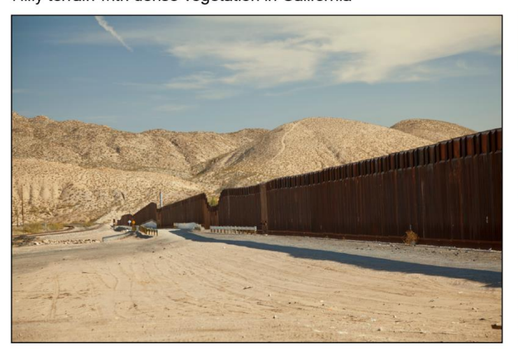
Mountainous terrain and desert shrub in New Mexico