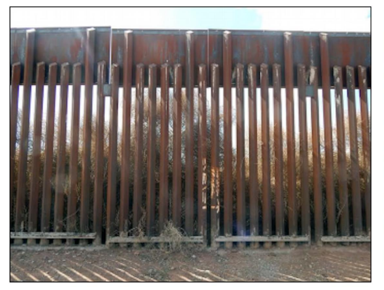
Bollard-style pedestrian fence

Source: GAO; photos were taken March 2016. | GAO-23-105443