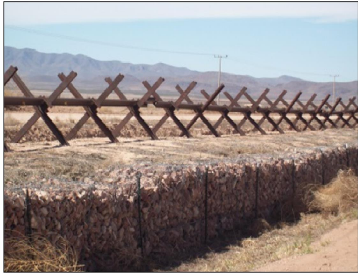
Normandy-style vehicle fence

photos were taken March 2016. | GAO-23-105443