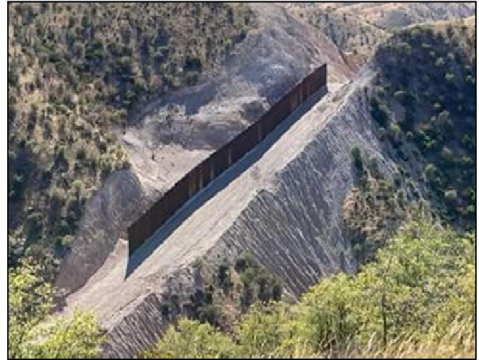
Erosion below the site of a cleared construction staging area (left); erosion below an area where only several border barrier panels were installed as of January 2021 (right).