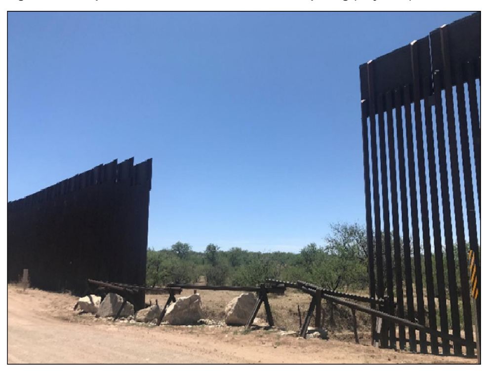
Figure 6: Incomplete Border Barrier in Arizona, with Opening (May 2022)

installed all components of the barrier system, including lights.<sup>46</sup> In addition, at some project sites, contractors installed noncontiguous sections of panels that, in some cases, resulted in openings greater than 100 feet between the different panel sections. For example, in some cases, contractors installed barrier panels but did not install flood or access gates that connect them (see fig. 6).