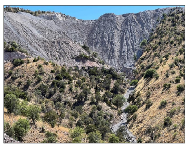
Figure 11: Erosion on the Coronado National Forest in Arizona (May 2022)

• According to CBP, Interior, and Forest Service officials, contractors built a large construction staging area near the top of a mountain in the Pajarito Mountains on the Coronado National Forest in Arizona, clearing the mountainside of its vegetation that kept the soil in place. As a result, silt is draining down the side of the mountain and, according to Forest Service officials, is beginning to fill a human-made pond, threatening to eliminate it as a drinking source for cattle and wildlife. Moreover, the entire mountainside is in danger of collapse, according to a Forest Service official. Figure 11 shows the erosion that has occurred at multiple locations in the area.