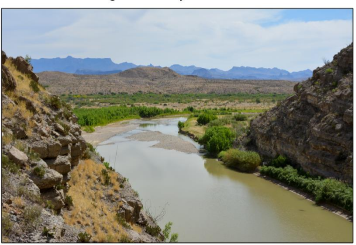
Remote mountainous terrain and river areas, including thick vegetation, in Texas

Sources (clockwise from upper left): U.S. Customs and Border Protection, M.PartsPhoto/stock.adobe.com, Mosto/stock.adobe.com, Arturo M/stock.adobe.com. | GAO-23-105443