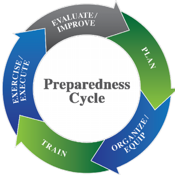
Figure 3: U.S. Coast Guard Preparedness Cycle

Source: U.S. Coast Guard. | GAO-23-106409