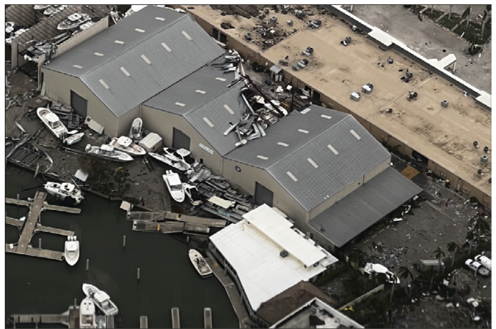
Coast Guard flights over parts of western Florida to locate survivors and assess damage after Hurricane Ian.

GAO-23-106409