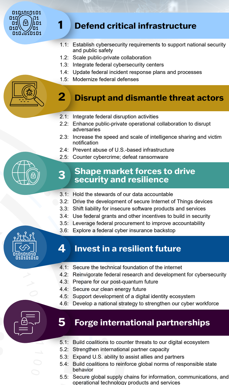
Figure 1. Five Pillars of the National Cybersecurity Strategy

Sources: GAO analysis of the National Cybersecurity Strategy ; marinashvchenko/stock.adobe.com (icons). | GAO-23-106826