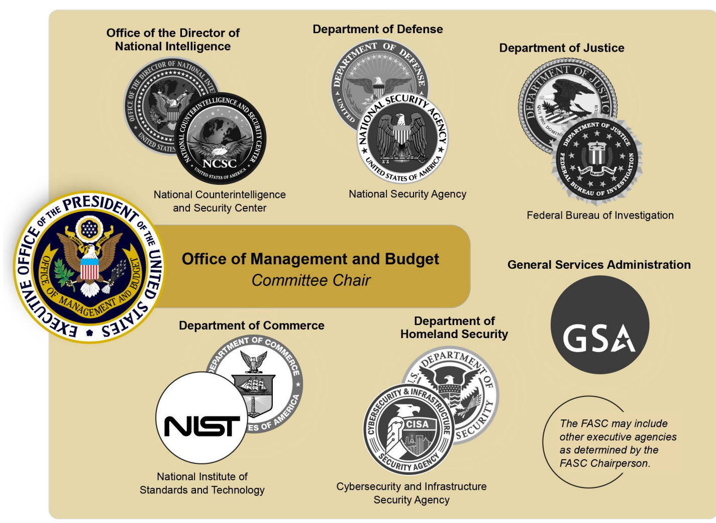
Figure 3: Members of the Federal Acquisition Security Council (FASC)

Source: GAO analysis of 41 U.S.C. 1322(b). | GAO-23-105612