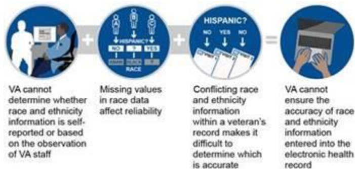
Source: GAO analysis of Department of Veterans Affairs' information. | GAO-23-106254

Additionally, we found that while the pay gap between men and women in the federal government is smaller than in the entire U.S. workforce, studies show that pay disparities still exist.