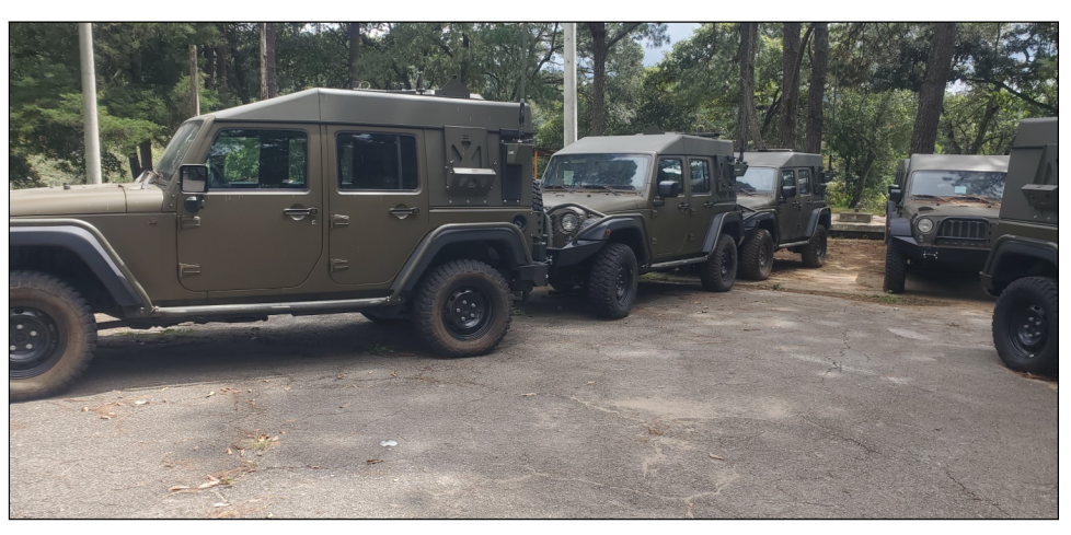
Figure 2: Jeeps Provided by DOD to the Government of Guatemala

According to DOD officials, from 2013 to 2018, the U.S. government delivered 220 Jeeps using the counter-narcotics authority contained in Section 1033 to Guatemala to support the country's interagency task forces (IATFs). The IATFs are joint battalion-sized task forces composed of National Counter-narcotics Police, Guatemalan Army soldiers, and Customs and Public Ministry officials, with the goal of preventing, combating, dismantling, and eradicating criminal activities, according to DOD officials. The IATFs are designed to work independently along the border, interdict irregular traffic, bolster security in border areas, and inspect border crossings to deter narcotics and other illicit trafficking. According to DOD officials, Guatemala's Ministry of Government controls the IATF units (see fig. 2).