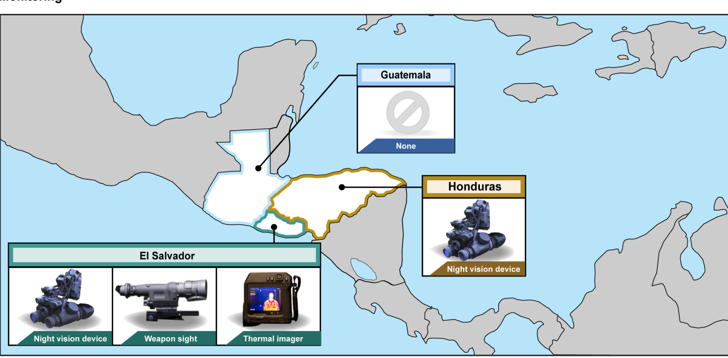
Figure 4: Examples of Equipment Types DOD Provided Northern Triangle Countries That Are Subject to Enhanced End-Use Monitoring