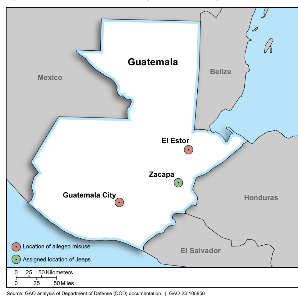
Figure 3: Locations in Guatemala of Alleged Misuse Involving DOD-Provided Jeeps

Source: GAO analysis of Department of Defense (DOD) documentation. | GAO-23-105856