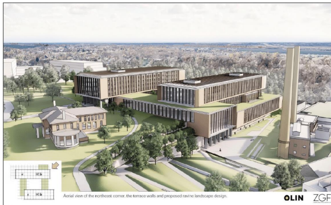
Figure 2: Cybersecurity and Infrastructure Security Agency (CISA) Building Preliminary Design Concept

| GAO-22-105970