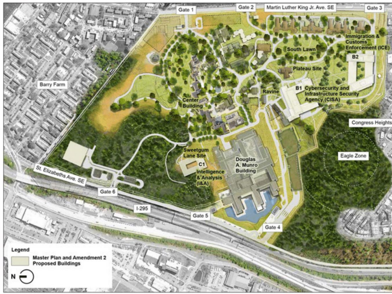
Figure 1: Map of St. Elizabeths West Campus