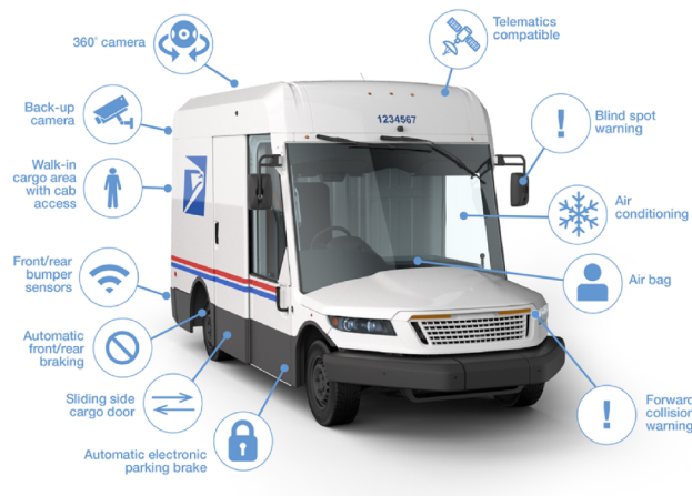
Image of the Next Generation Delivery Vehicle

Source: United States Postal Service. | GAO-22-105931