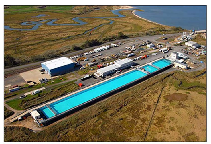
Figure 3: Department of the Interior's Wave Tank Facility in New Jersey